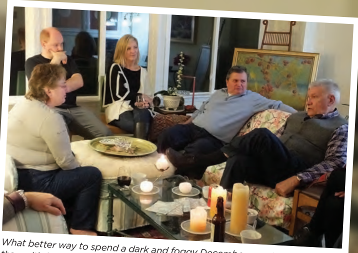
What better way to spend a dark and foggy December evening, than with fellow Porsche enthusiasts swapping stories and laughs.