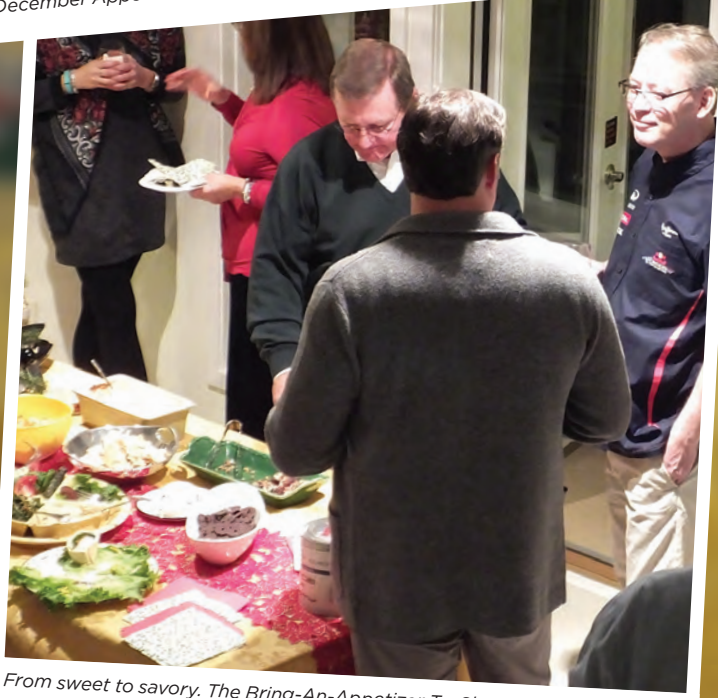
From sweet to savory. The Bring-An-Appetizer-To-Share buffet offered many tasty treats. Couldn't make it? There's always next year.