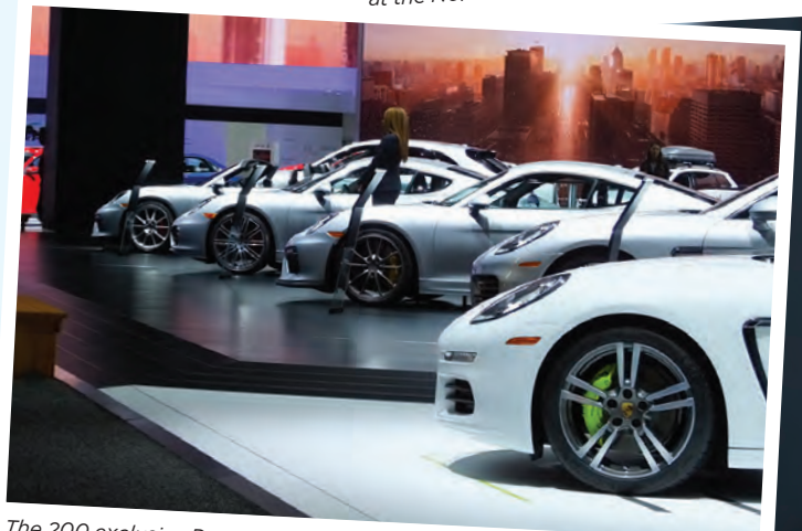
The 200 exclusive Porsche Club event tickets are always gone in a hurry. Still, we happily wander through this array of stunning beauties.