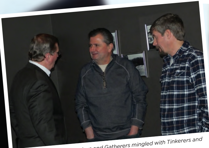
January Dinner Drive: Hunters and Gatherers mingled with Tinkerers and Toy makers sharing insights, prices and good times.