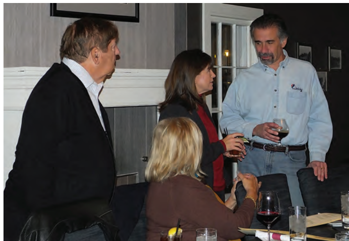
More photos of the January event can be found on the next page.