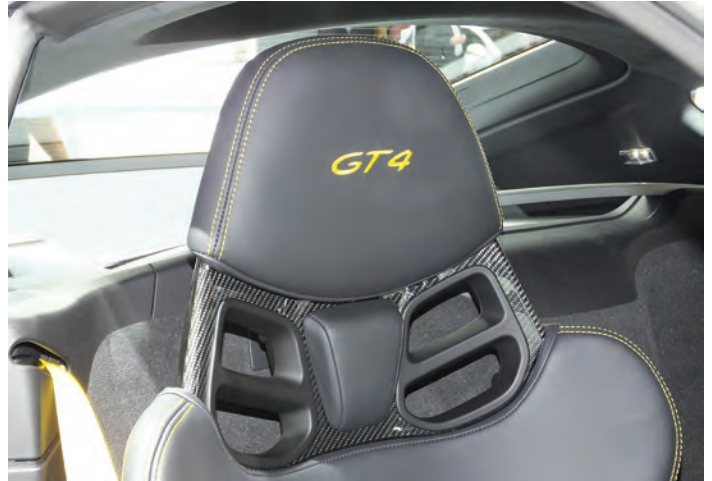
Editor's Note: I have a feeling Mike was testing "the office" a few times.

We were impressed by three new 911 variants wearing the new, eye-catching Graphite Blue Metallic paint and I was pleased by the presence of a Cayman GT4.