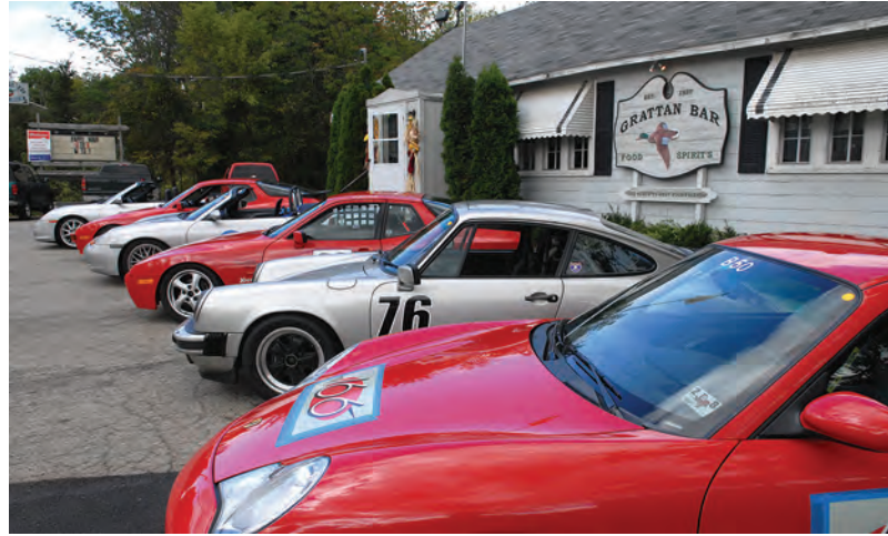
Can't wait for Spring.

6:00 pm Social Hour, Drinks / 7:00 pm Dinner