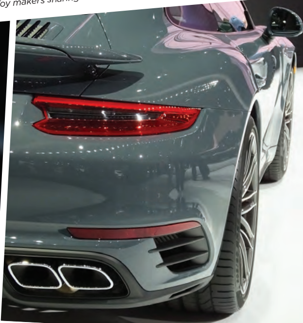
Don't show these shiny tailpipes to the EPA. Good thing a 911 Turbo doesn't have to worry about that. It can simply outrun any government official.