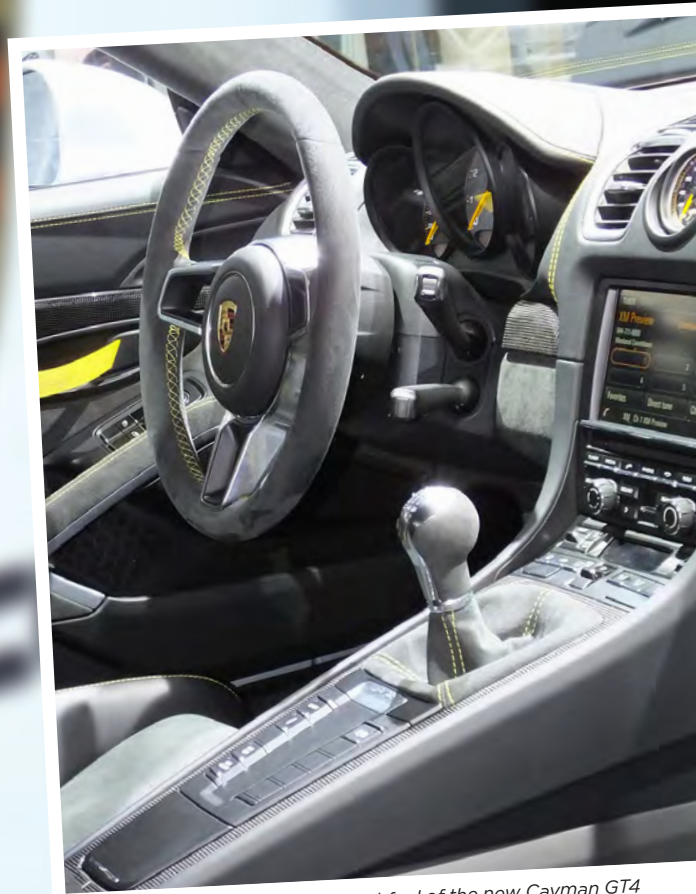
The first touch-and-feel of the new Cayman GT4 at the North American International Autoshow.