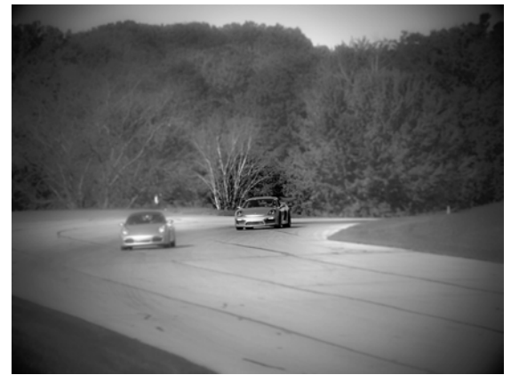
The President in his Cayman GT4 entering the front straight at Grattan

I had my third Porsche peak experience this year at Grattan. Peak experience is "a term coined by Abraham Maslow to characterize a profound moment in a person's life, an instance when they feel in harmony with all things, clear, spontaneous, independent, and alert and often with relatively little awareness of time and space," though when driving on the track, one is always aware of time and space. My first automotive peak experience was the feeling of agility of a BMW 2002tii in the mid-70s. The second was the wondrous braking power of a 996 C4S during my first DE at Gingerman in 2009. The third was the acceleration of a 996 Turbo. The fourth occurred in my first track outing with the Cayman GT4, which recalled the relative agility of the 2002tii, but with confidence-inspiring stability of an entirely different level. The lightness and precision of the steering of the GT4 had an old-school feel and reminded me of the only other Porsche I've had the pleasure of driving, an '86 Targa.