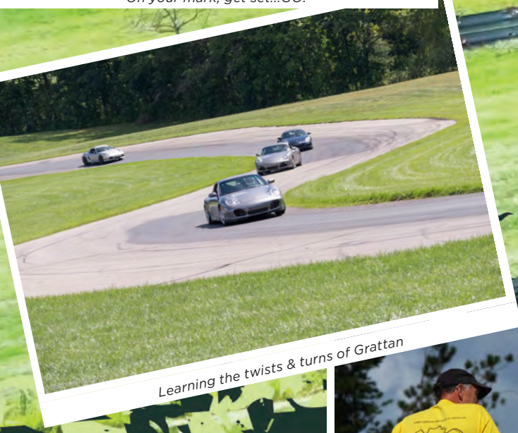
Learning the twists & turns of Grattan