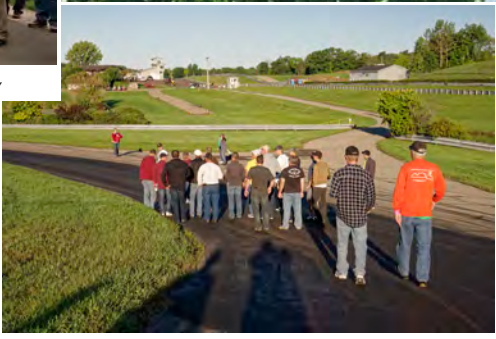
Students walking the track to learn how to drive on the track