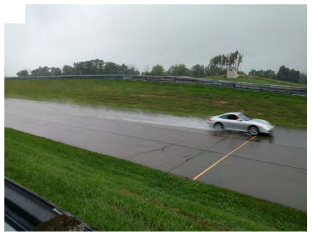
...And he wins by a nose in the rain