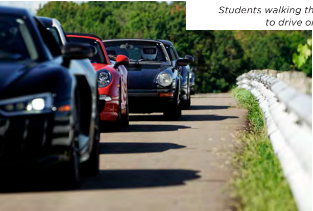
On your mark, get set...GO!