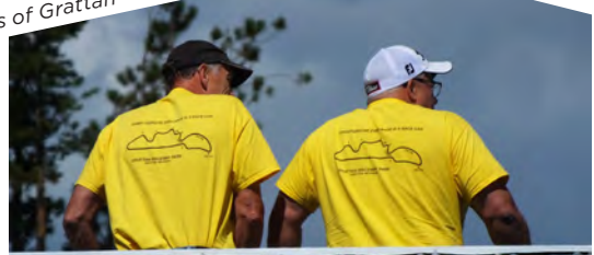
Watching is just as fun as driving...almost