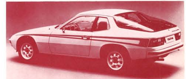
MARTINI & ROSSI 924