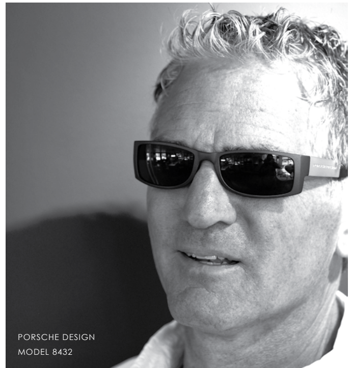
PORSCHE DESIGN MODEL 8432

Cheap! Only 4 bucks each, plus $1 shipping. Contact Ted Blacklidge at (616) 866-4143 or sgrafex@chartermi.net