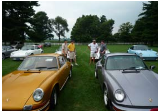
Admiring and discussing Stuttgart's finest