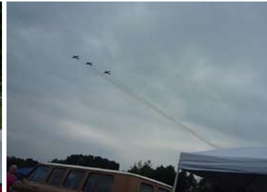
WWII fighter trainers make a pass