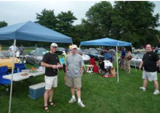
The Porsche Corral

From muscle cars and hot-rods to one-off customs, wooden boats, 1940s Cushman scooters, a Bowden Spacelander bicycle, and an outrageous custom motorcycle with a 426 Hemi V-8 and a nitrous bottle, this show had it all. If you've never seen this incredible car show, you owe it to yourself to experience it!