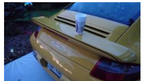
The Porsche 911 Turbo cupholder