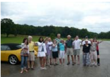
Hey, are those storm clouds?

Text by Ted Blackledge