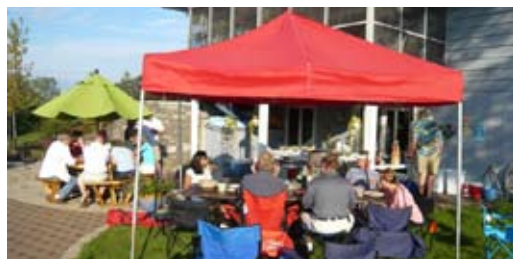
Party at the Ackermans' Home