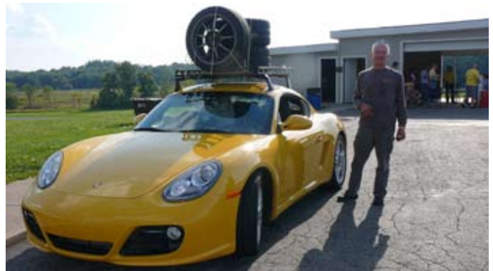
The proper use of Porsche’s Roof Transport System (RTS)