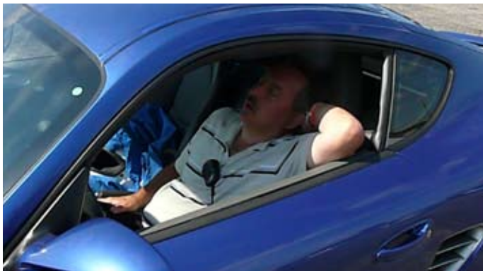
The Voice of the Track takes a break