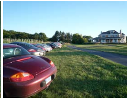
The view up the hill