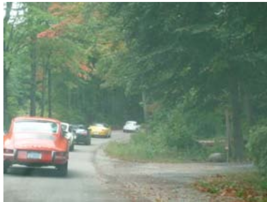
A very spirited drive through winding roads!