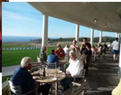
Enjoying the weather on the porch