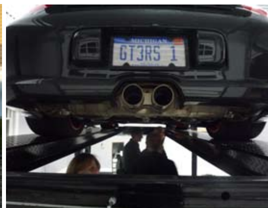
Inspecting the belly of the beast