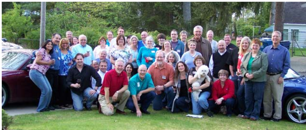
39 hungry enthusiasts joined us for a great cookoff event! (...and created a great cover photo for our Facebook page!)

Thank goodness for great ideas! Next year’s cook-off takes place on the Saturday after tax day and the theme is “Gmund Goulash”, so start Googling it to find your new favorite recipe!