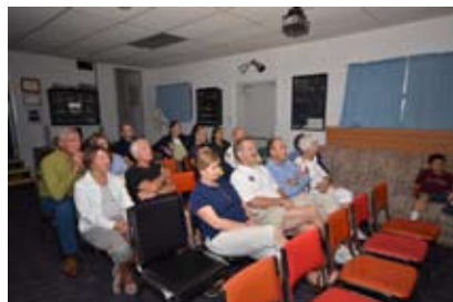
Enjoying the informative presentation