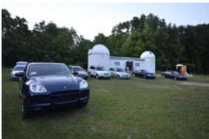
The observatory never looked so good!

My impression was the guests that evening had just had their appetites for astronomy whetted and will be back. Thanks to all who joined us, and we look forward to seeing you again at the Veen Observatory!