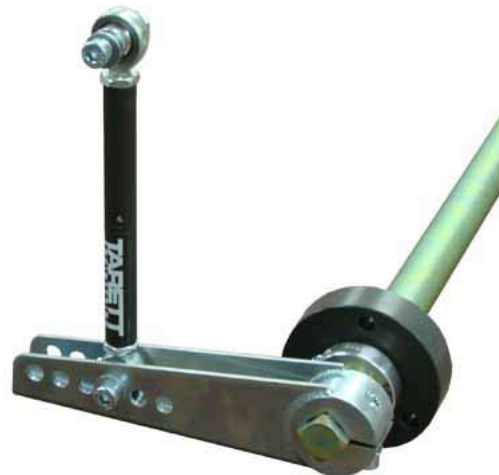
An aftermarket adjustable sway bar from Tarett