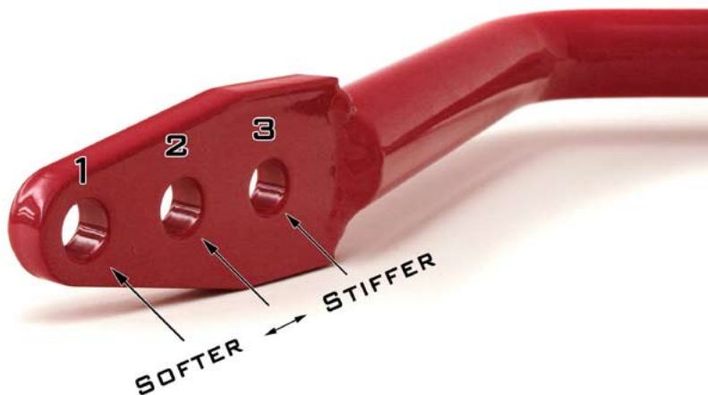
Adjustments on a 22mm Cusco sway bar for a Subaru WRX

Fine tuning your suspension involves components and factors such as tire pressure, shock packages, spring rates, etc. Seeking a professional with experience in this area is a necessity to obtain the best results.