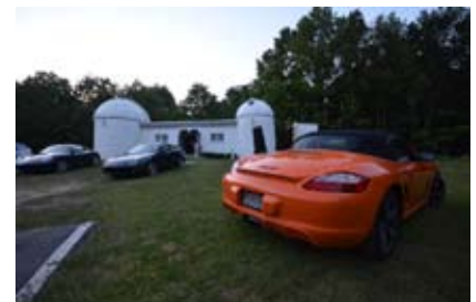
How did that bright orange start get so close...