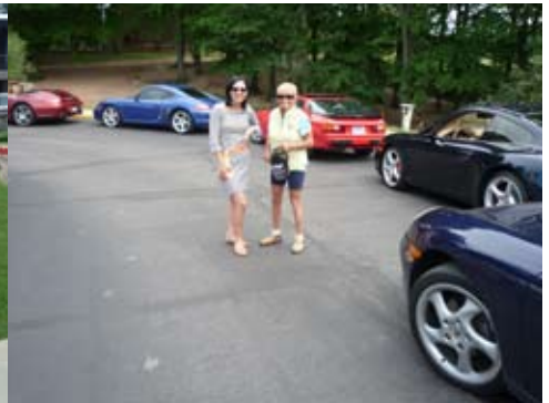
Lovely ladies, lovely cars!