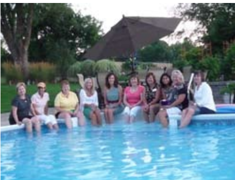
Cooling off around the pool