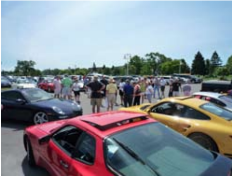
Getting ready to roll at Clinch Park Marina