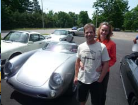
Handbuilt created the Boxster S 550 Spyder