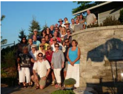
Group photo as the sun sets