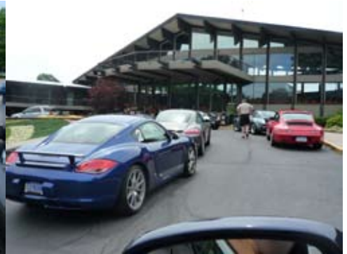
Taking a breather at Shanty Creek