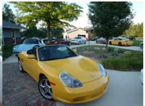
The Ackerman's beautiful driveway