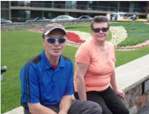
The Klunks take a break & enjoy the view