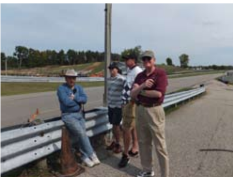
What's that saying about idle hands?