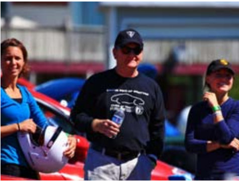
Grattan is great for drivers & spectators alike