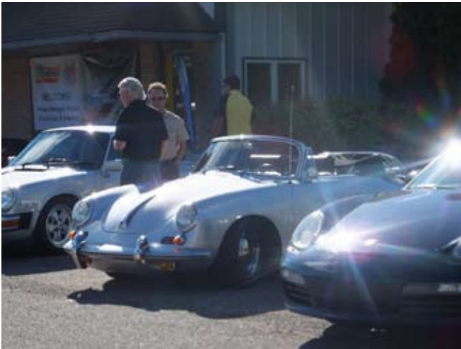
The sun shines on Stuttgart’s finest