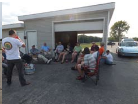
Relaxing at day's end