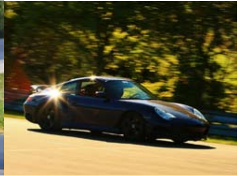
996 blings in the sunshine