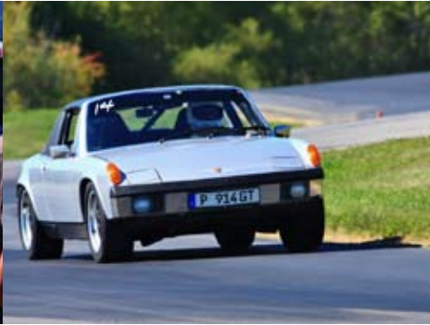
914 comes onto the straight