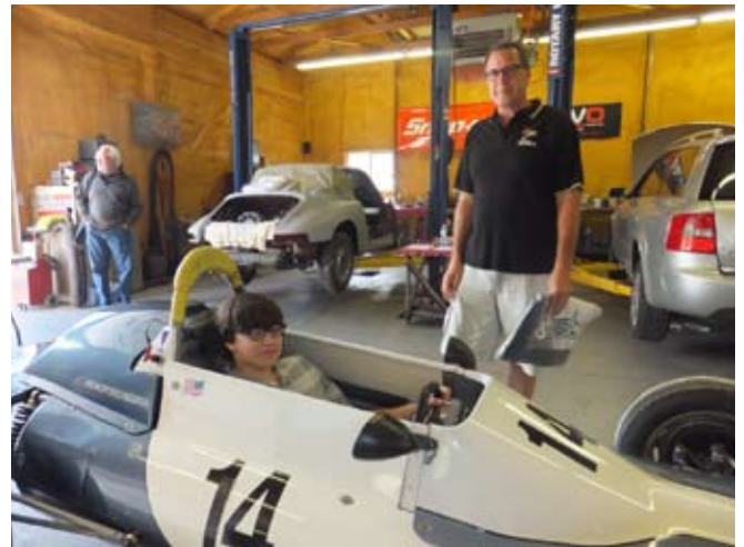
The Carpenters enjoying one of the toys in the shop