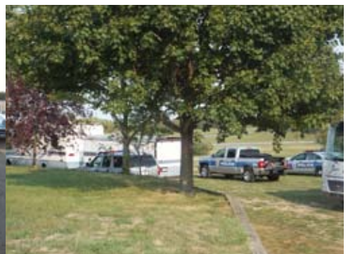
Even the police got in on the fun