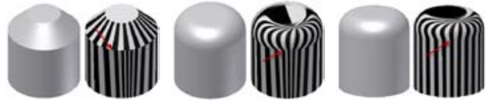
Positional (G0), Tangential (G1), and Curve-Continuous (G2) surface transitions. 'Zebra lights' show how light will reflect off the surfaces.

Modern CAD programs have a 'zebra light' function that can show in a 3D rendering how light will reflect over the surfaces, to aid the designers while rendering and tweaking the surfaces.