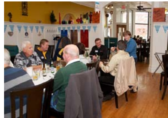
Members new and old enjoy the German cuisine