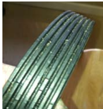
A worn serpentine belt

Often overlooked during a belt inspection are the tensioners and pulleys that they ride on. Inspection of these items are a must to prevent belt failure. A bad tensioner will allow a belt to slip, causing premature wear. A worn pulley bearing can allow a belt to wear unevenly and begin to shred on the edges. Worse yet is when the bearing fails completely causing the belt to come off the pulley and cause damage to other components.