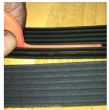
Checking with a gauge

While visual inspections can help avoid trouble, replacing critical parts in accordance with the manufacturer's recommendations is your best insurance against engine failure. Waiting until there is a problem, is a very expensive strategy.