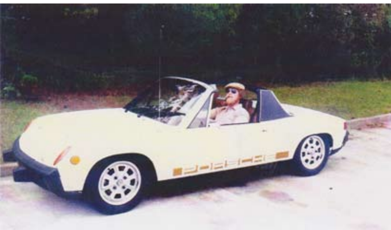
A much younger me with Trigger, circa 1981-1982

The fuel injection balked within the first couple of months. I limped it to a "furrun" car repair shop in town for an estimate. The mechanic pointed to a row of D-Jet components hanging on the wall. He said they switched out parts, one at a time, until the car ran right, and then charged for the time and part. I coaxed the car back to my apartment and ordered a carb conversion kit for about $300. Thirty years later, it still runs fine on that same Weber carb, although I've rebuilt it a few times. A series of engine upgrades, as well as suspension makeovers, have prevented "Trigger" (after Roy Rogers' loyal horse) from getting tired.