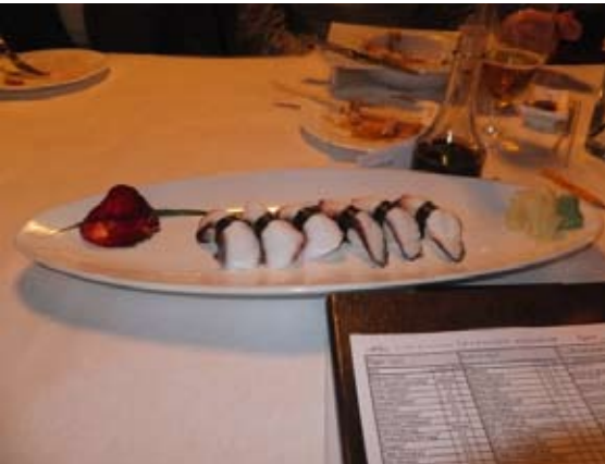
Octopus sushi was a treat!