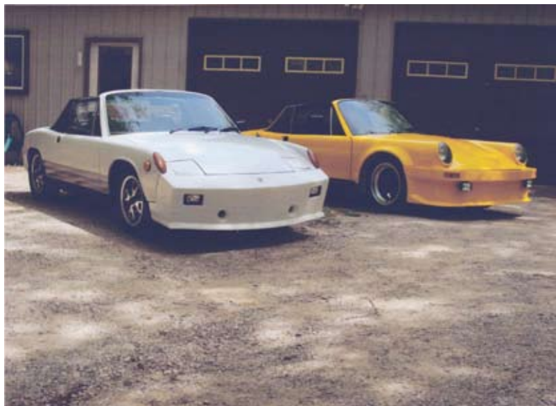
Trigger and Yeller, present day

In those thirty years, nobody but me has ever driven or put a wrench on Trigger. I remove the alloy wheels and take them to the tire shop. I only buy tires where they let me watch the guy doing the mounting and balancing, a task often unfortunately assigned to the "the new kid". She goes on the road as soon as the winter salt is washed away by a couple of good spring rains. I drive every day I can until snow flies, and only use the top when it's raining or below 50 degrees. I may hold a record of some kind for "seat time" in a single 914. Friends and neighbors joke about seeing me grinning from ear to ear when I'm out driving the "little white car".