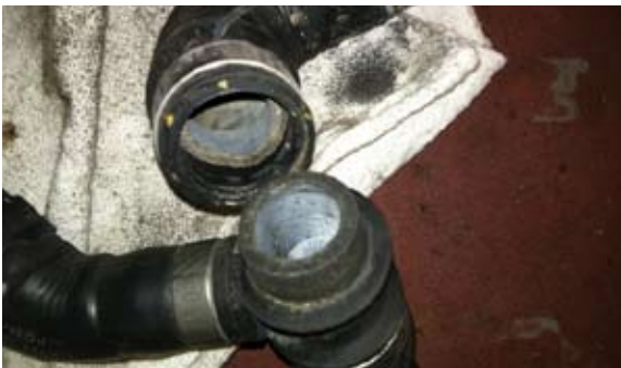
Plastic coolant pipes and junction.

Plastic connectors and components used in the cooling systems also suffer the same fate as hoses due to the electrical current. Often the first indication of wear or potential failure shown by plastic parts is softness and splitting of the ends. Often you can determine this condition by gently squeezing the ends of the connector. With regular and careful examination of hoses and plastic connectors, you can often detect these conditions and avoid total failure of the part.