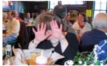
Amber loves the camera