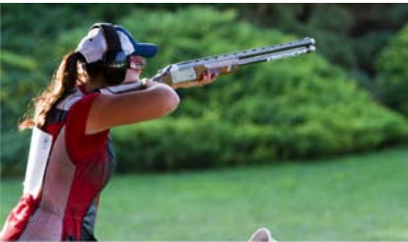
2008 Olympic bronze medalist Corey Cogdell

This is outside and in the woods along a groomed trail. Please wear appropriate clothing & shoes. Eye and ear protection are MANDATORY , bring your own or purchase on site. The event cost will be $22.00, not including gun (rent @ $10.00) / ammunition (purchase @ $6.95/box). You are welcome to bring your own shotgun. For those members that want to accompany another participant, but is are not interested in shooting, there is an indoor area available to hang out. Additionally, there are golf carts available if needed.