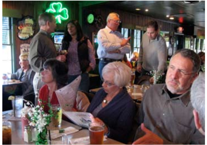
What a crowd, what a fun time!

The food is homegrown and finger-licking-good! You can't stop eating! The place is small and the seating arrangements are sort of chaotic, but oh, so much fun, especially when Porsche folks get together. So sorry if you missed us. Make sure you join us next year!