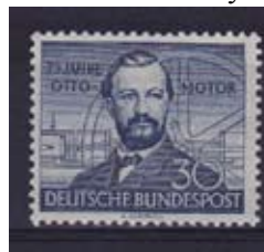
Nicholas August Otto

Footnote: It was German engineer August Otto, who in 1866 improved and made a more efficient gasoline engine than others. Evidence shows that the Germans still know how to do it today!