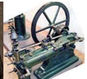
An Otto engine, c. 1886