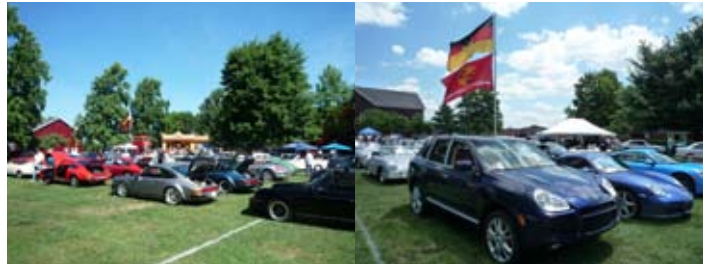
What a beautiful day!