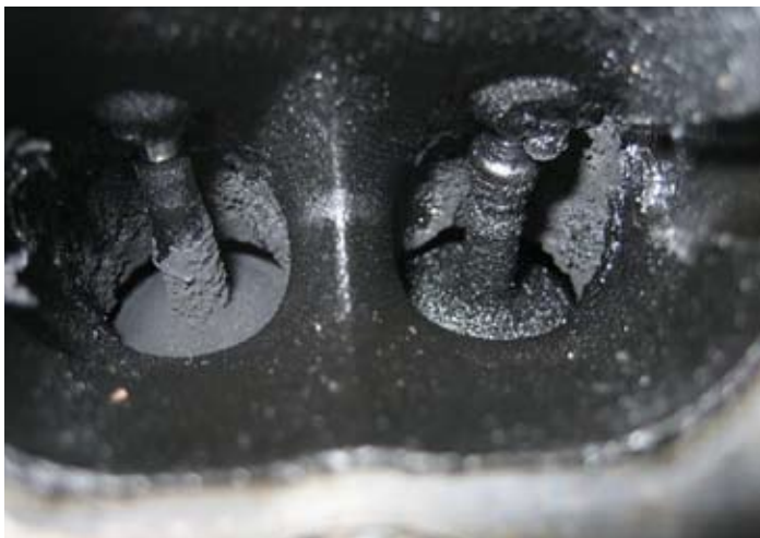
An example of carbon buildup in an engine's intake

It appears that the Porsche, Audi and VW group are ahead of the curve when it comes to this technology, and to date we have seen no problems with these engines. We have had pump and injection failures on VW and Audi products, but nothing to date on Porsche.