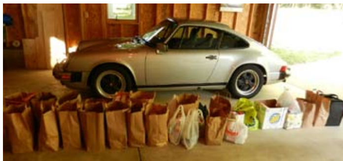
Our collection for the Feeding America West Michigan Food Bank

rides (and, of course, gazing at three rows of beautiful cars in the grass across the road). Some of the younger attendees even went swimming, while most chilled in the house or shade of the driveway and, as we tend to do, talked the afternoon away. The food and company were all we could have hoped for.