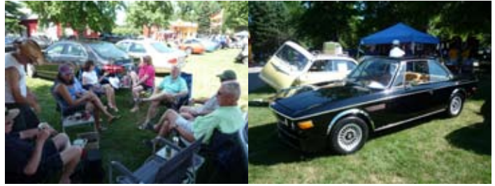
PCA members find some shade

Started by the local chapter of the BMW Car Club of America and the Mercedes-Benz Club of Western Michigan, WMR PCA participated in big numbers once again, as did dozens of local Volkswagen owners. The rare and unique cars were out in force, including a stunning black BMW 3.0 CS (Tom Ripley of Gull Lake), and a funky orange VW