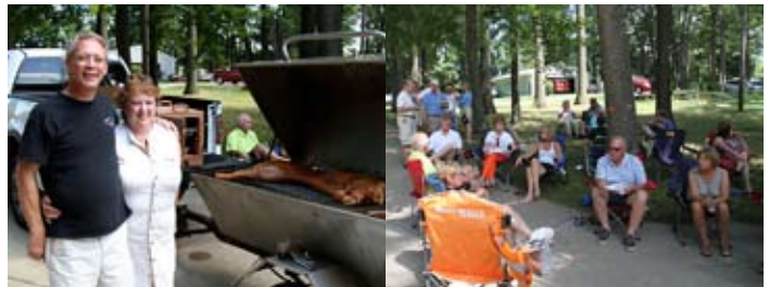
An awesome pig roast!

We couldn’t have asked for better weather – Saturday was sunny and very warm, tempered by a slight breeze. The 56 attendees enjoyed a full afternoon of food (pulled roast pig with many fixings), sun, camaraderie, and pontoon boat