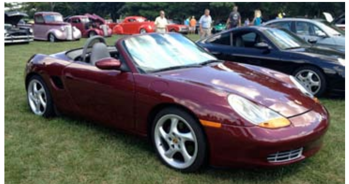
Now: Our well-worn, trusted friend