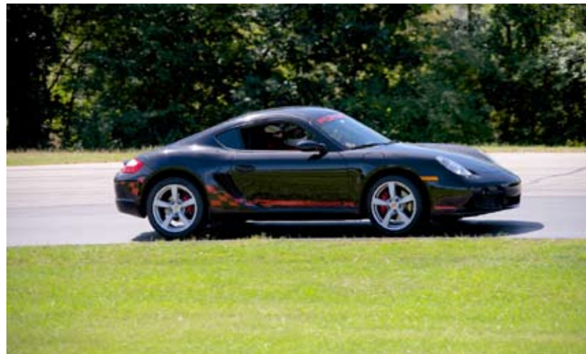
Cayman S doing what it was always meant to do