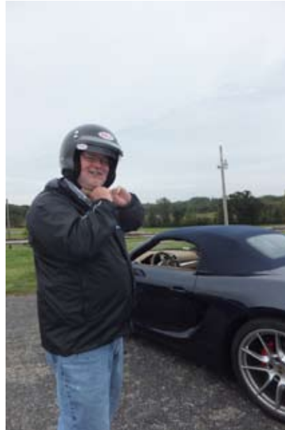
Suiting up before take off!