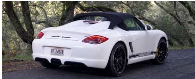
A modern-day specialty model, the Boxster Spyder

In addition, with the car well maintained, you should lose no more than 7 to 10% of the purchase value from that point on each year.