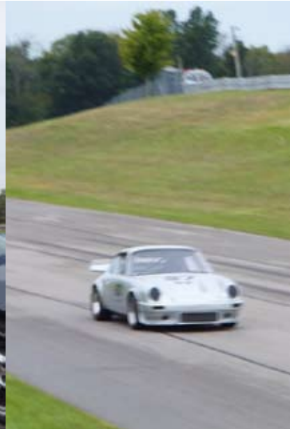
A silver bullet on the front straight