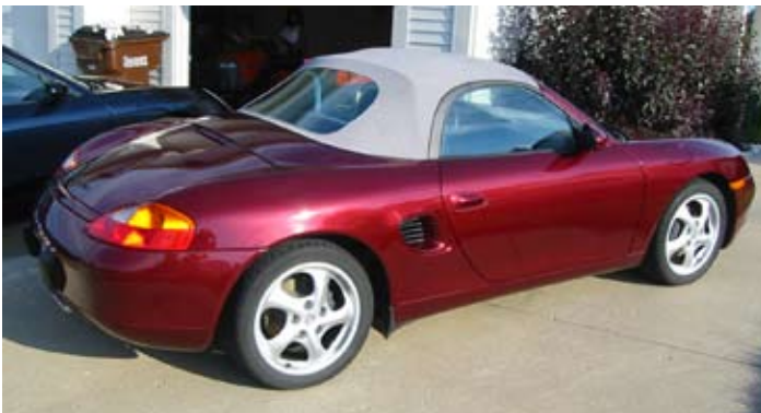
Then: New to us, and nearly new

We follow the factory maintenance schedule (15k oil changes), always use factory parts (even filters & plugs), and Mobil 1. Other than normal wear items (and things I broke), only the alternator and windshield have been replaced. How can this be? We drive the heck out of this car. I even do donuts with it in the winter! (You haven't lived...)