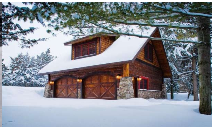
...or to store your Porsche? That is the question...