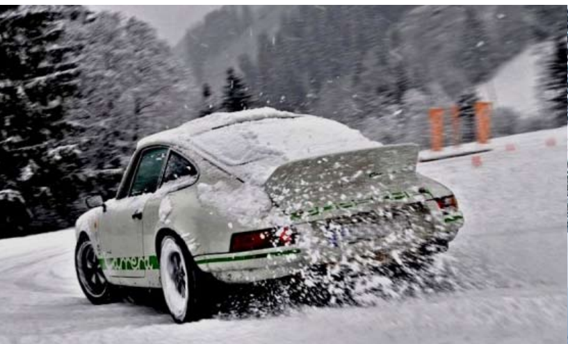
To drive, to love, to hang the tail out...

Lastly, don't forget your winter ride. Have its coolant, brakes, tires, heating system and state of tune checked. Once your cars are properly prepared, you can relax and enjoy the winter activities, knowing that your Porsche is ready for spring.