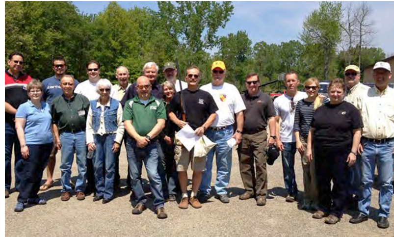
Look back at the 2013 Sporting Clays attendees and their “bullets” (bottom).

Please wear appropriate clothing and shoes. Eye and ear protection is REQUIRED. Regular glasses/sunglasses are adequate and they do have some protective eyewear available, but if it's busy they may run out. They also sell earplugs. Guns are available to rent for 10.00 (2 people can share 1 gun) and of course ammunition is available for sale. The cost will be 22.00, not including gun (10.00) /ammunition (6.95/box). Of course you are welcome to bring your own shotgun.