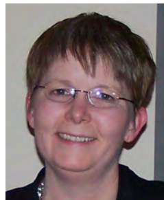
Amber Door Treasurer, 1984 Porsche 911 Coupe

637 South Shore Dr. Kalamazoo, MI 49002-6942 (269) 370-9183 blue911rsr@charter.net