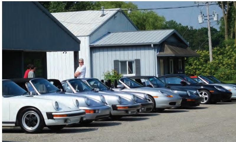
Now that's how we like our "Paddock". Filled with happy Porsches.