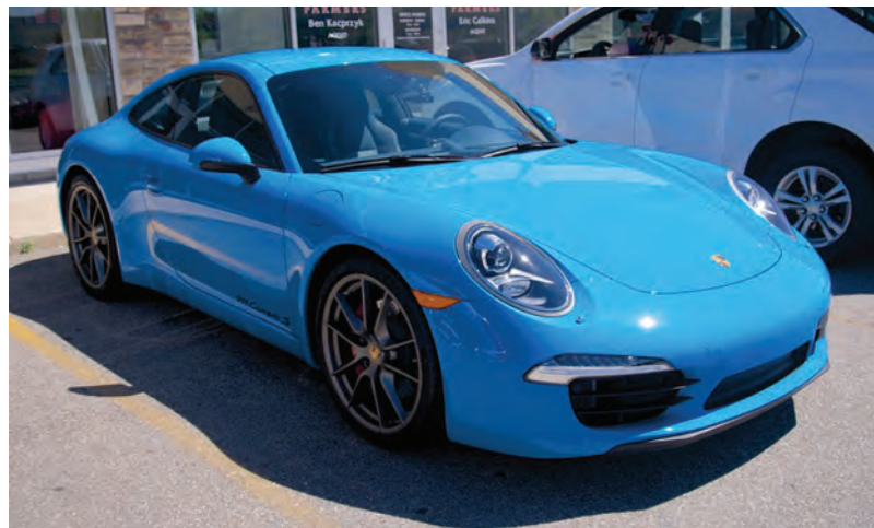
Is that close to original 1964 Enamel (Sky) Blue (#6403)? Talk amongst yourselves.