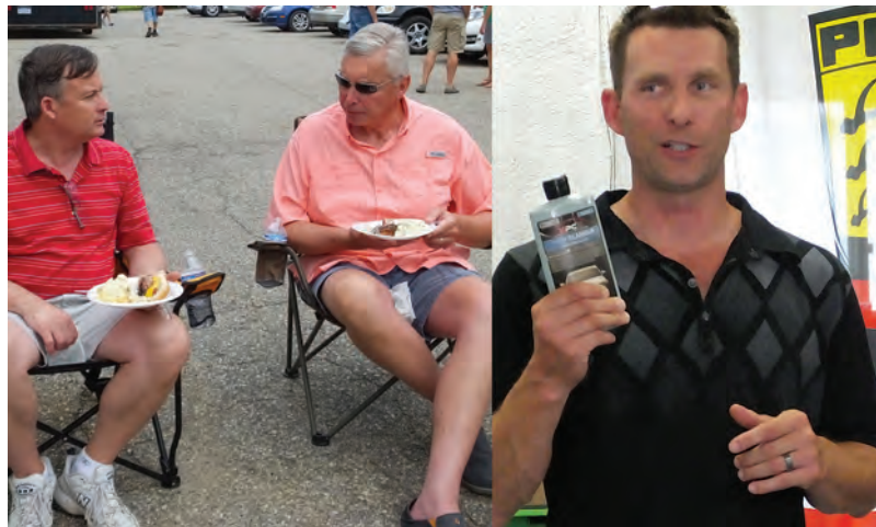
Left: Does this sauce taste funny to you? Right: Now remember, this isn't my magic BBQ sauce. It goes on the car.

Coming up in the August issue of the Über Alles: Tires – What is on your car and what do those numbers mean? Have an idea for a future TechSpalte? Don't be shy.