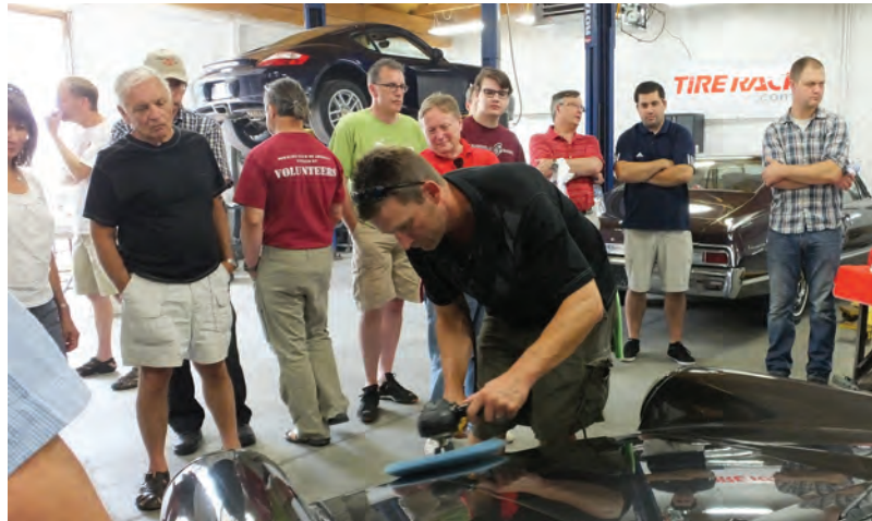
The Master demonstrates "Wax on. Wax off." Remember the movie "Karate Kid"?