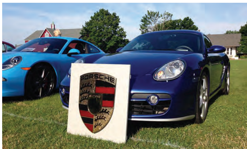
Lots of action at the Gilmore Car Museum in July. Deutsche Marques and the Wednesday Night Cruise-In back to back.