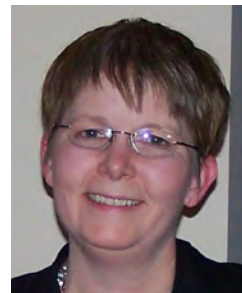
Amber Door Treasurer, 1984 Porsche 911 Coupe

637 South Shore Dr. Kalamazoo, MI 49002-6942 (269) 370-9183 blue911rsr@charter.net