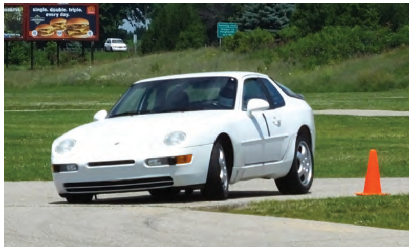
Corner carving, IROC-style. Looking far ahead is key.