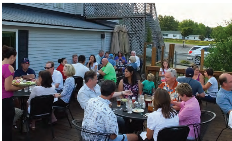
The WMR PCA members take over the lakeside deck at Smugglers Cove