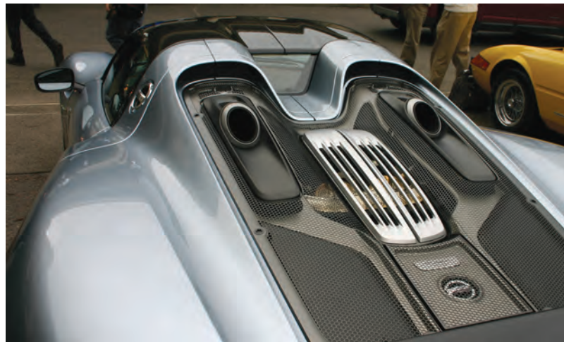
September is a great month for us Western Michigan PCA members to log some fun-filled miles with our Porsche cars. Car Shows, scenic Dinner Drives and thrilling on and off race-track excitement. Just take a look at the event calendar and this month event promos.

A great deal of hard work goes into making these events the successes they are, and to all of the volunteers I want you to know that your efforts are not going unnoticed. One of the goals I set out at the Presidents' Meeting in March was to have Zone 4 regions begin to join forces and work together cohesively in order to provide even more opportunities for everyone to be able to enjoy our favorite cars. The hospitality and camaraderie displayed at these events confirms that we are on the right track. As I attend each event, it has been very rewarding to meet members from a variety of regions from throughout the zone.