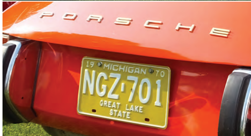
Top: Our club's front row display at the Red Barns. Bottom: Dinner Drive and Open House ambiance.