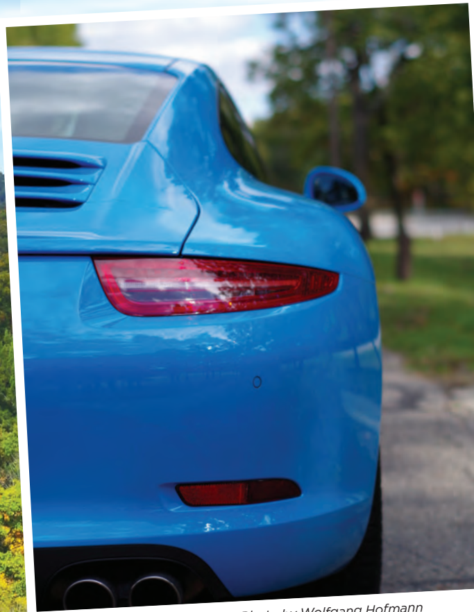
Blue Thunder... he's out there.