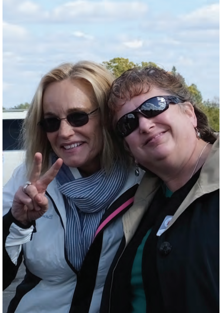
Well, hello there, ladies. Porsche comradery.

Some bewildered motorists were trying to make a late afternoon grocery run when they sat in awe in their driveway or — probably more likely — just wondered