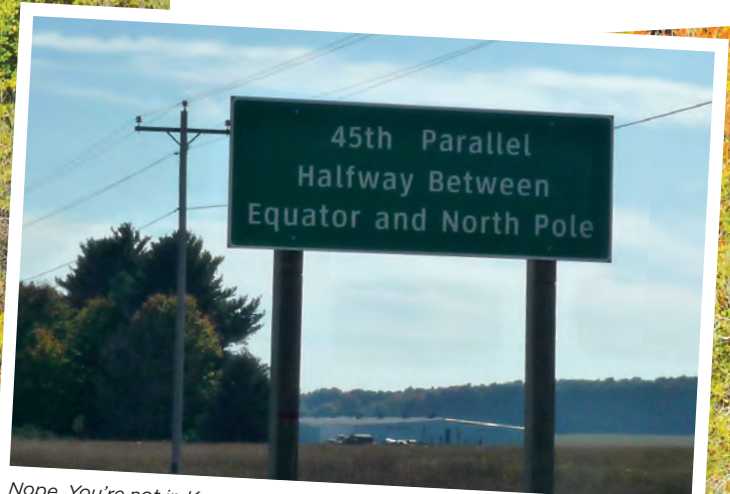
Nope. You're not in Kansas anymore. The sign going the other way reads: "Don't you wish you were home right now."