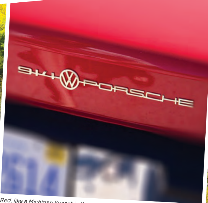
Red, like a Michigan Sunset in the Fall. The most pristine 914.