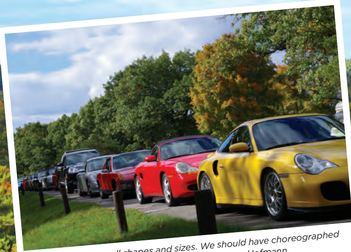
Our club welcomes all shapes and sizes. We should have choreographed the colors better. Next time.