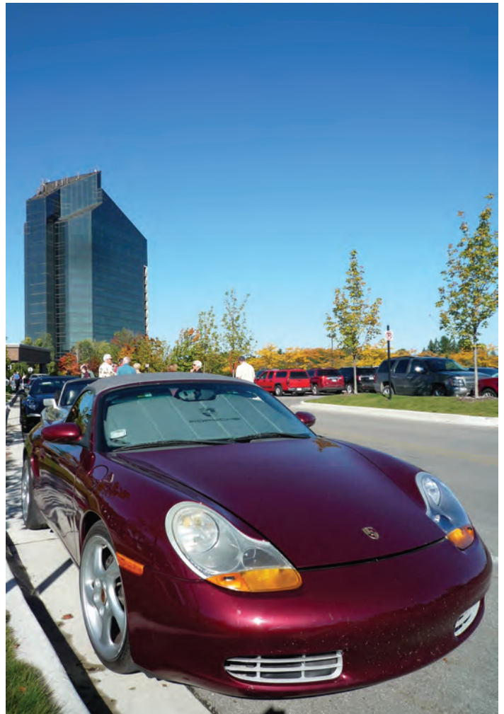
Still going strong. Where Ruby leads, all shall follow.