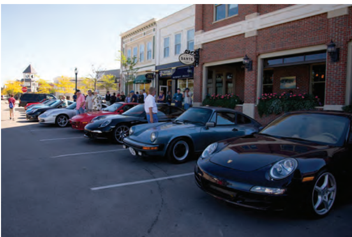
Makes for a fast exit when you forgot your wallet. Wait, that's Jag drivers.