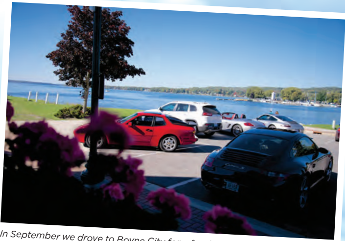
In September we drove to Boyer City for a fun fall weekend. Great Lakes Splendor. There's no substitute.