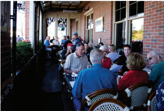
At Cafe Santé our members socialized with a fine Juan Gil 2012, from Spain.