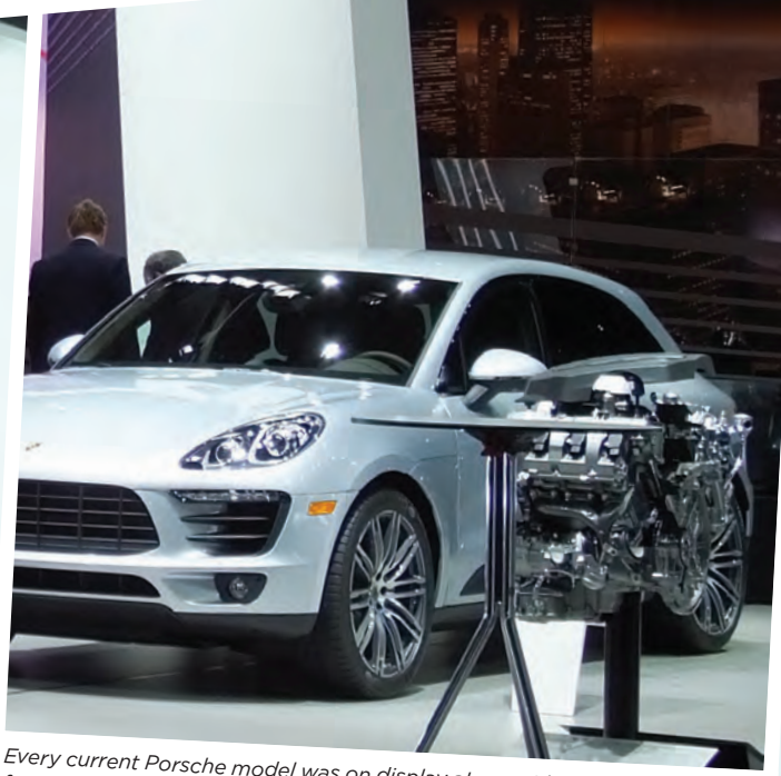
Every current Porsche model was on display along with some displays featuring the internals.