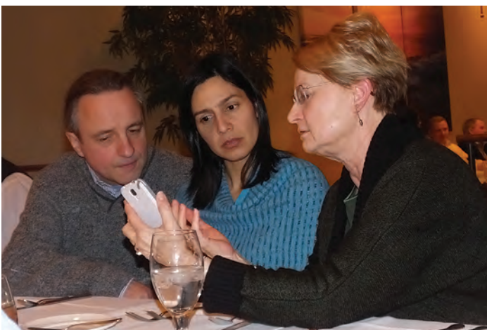
Look at these young kids today, with their hula hoops and fax machines.