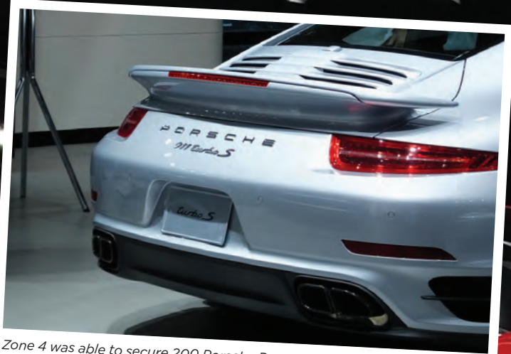
Zone 4 was able to secure 200 Porsche Preview Event tickets this year. At $20 per person they went very, very fast.