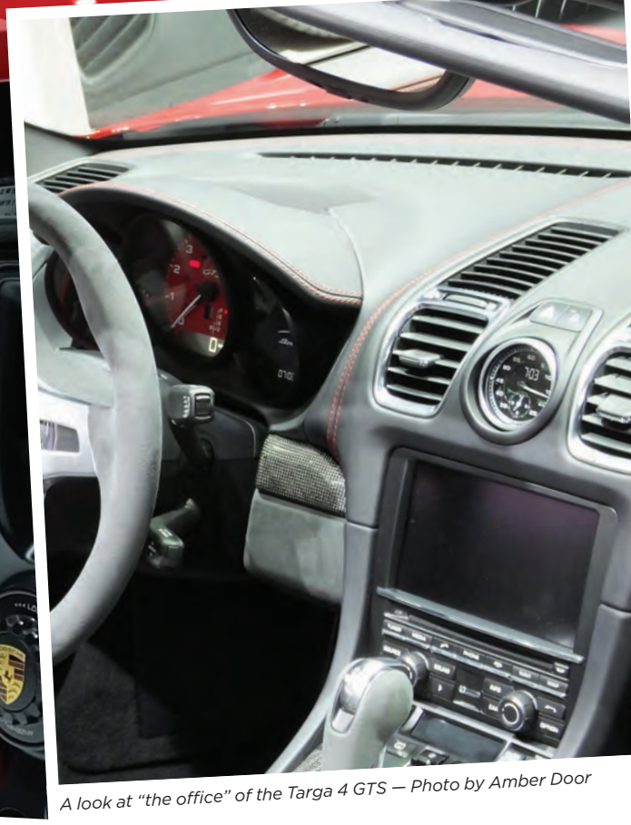
A look at "the office" of the Targa 4 GTS