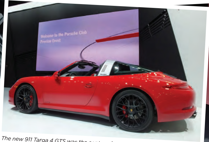
The new 911 Targa 4 GTS was the center of attention. Pretty red, pretty fast, pretty amazing.