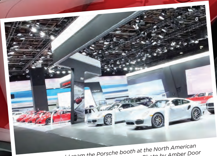
Our members could roam the Porsche booth at the North American International Auto Show before anyone else.