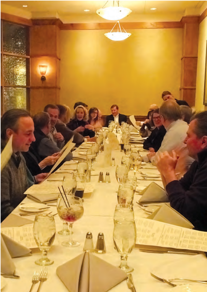
To "Sunshine, Porsches and Good Friends".

We did it again! 30 Western Michigan Porsche Club members gathered at Leo's Restaurant in Downtown Grand Rapids for the annual Leo's Dinner Drive. We assembled in the bar until the Chart Room, featuring the longest table in GR was ready for our group.