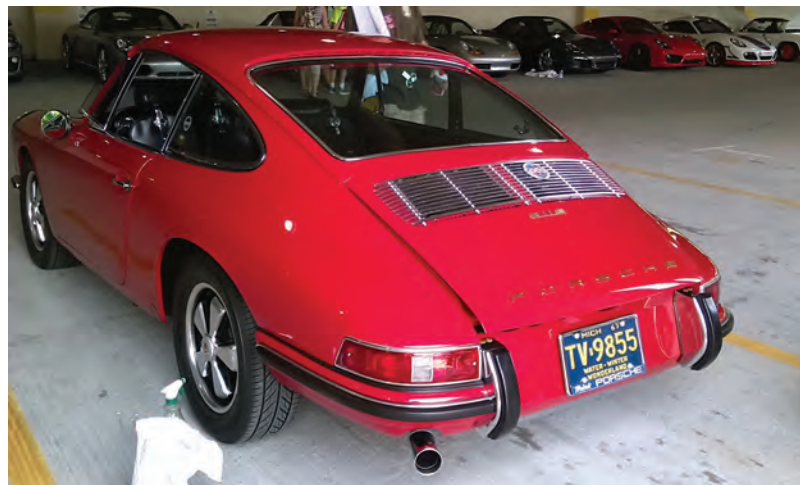
Concours day began early by drying the car and cleaning again. It is surprising how much dust floats around and lands on the shiny paint in an hour's time.

Rick Riley said the engine guy would have 8 foot arms and that is really what it looked like. His arm disappeared inside the engine all the way to his shoulder to reach the back wall to check for dirt. The time went quickly but holding your breath for 5 minutes is very difficult!