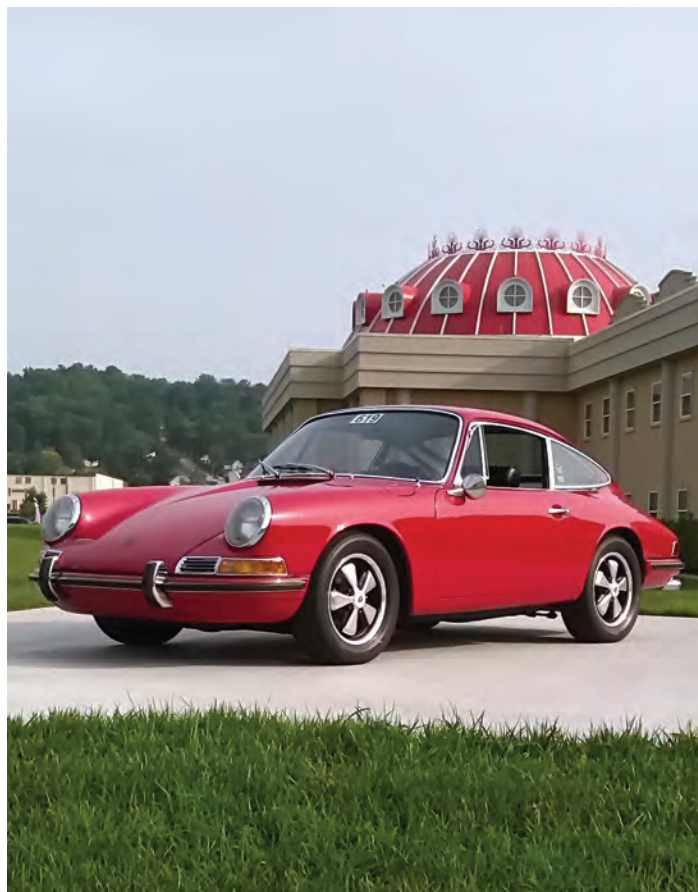
Now that's better.