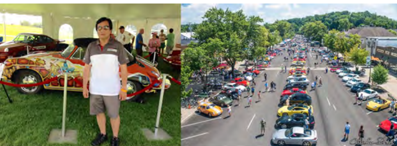
Left: Janis Joplin's 356 at PVGP; Right: P20

in conjunction with the club race. The next weekend I attended ARPCA's premiere event, the Pittsburgh Vintage Grand Prix at Schenley Park, which is one of only two vintage races that occur on public streets in the world, the other being in Monaco. It is a multi-day event that began with a kick-off party for visitors from out of town. In addition to the vintage races, there is an international car show, catered meals, and some great prizes. The highlight of the weekend, however, was the fact that after a great deal of hard work and determination, the organizers were able to reach an agreement with the Rock & Roll Hall of Fame to be able to display Janis Joplin's 356, which has only left the museum a few times.