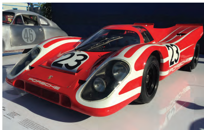
1969: Porsche 917 K "Salzburg" Overall Winner 1970 · 24 Hours of Le Mans