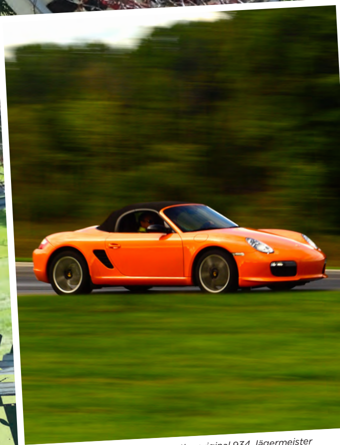
First sighting lap of the day. Not the original 934 Jägermeister — one has to start somewhere.