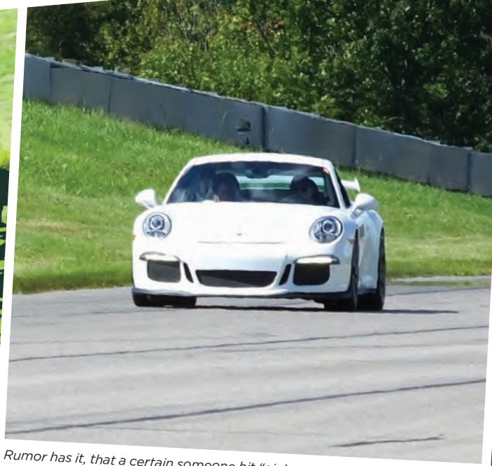
Rumor has it, that a certain someone hit "einhundertdreißig" mph at the end of the straight — Parade laps had a more relaxed 60 mph pace.