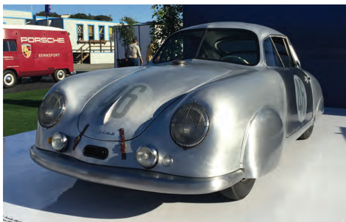
1949: Porsche 356 SL Class Winner 1951 · 24 Hours of Le Mans