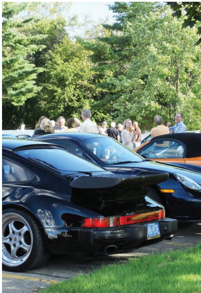
The good folks of the WMR Porsche Club arriving at Riverhouse Ada.