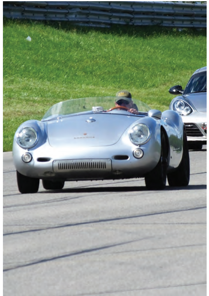
A rare Porsche 550 1500RS Spyder on track, during our Lunch Charity laps.