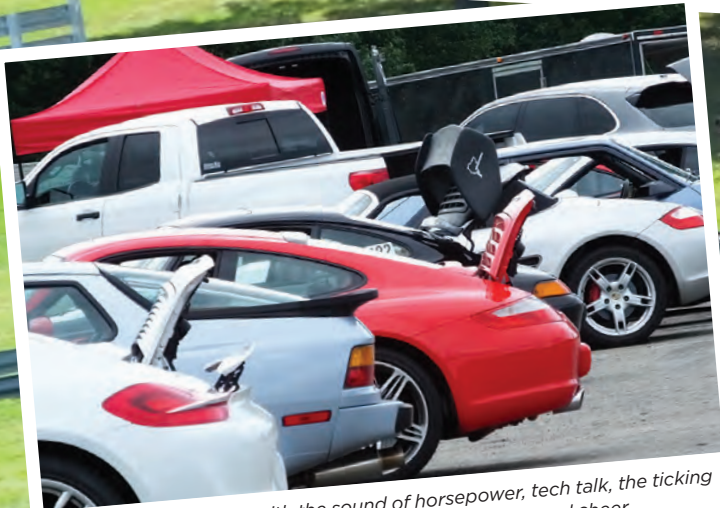
The paddock was alive with the sound of horsepower, tech talk, the ticking of engines cooling off from the last run, laughter and good cheer.