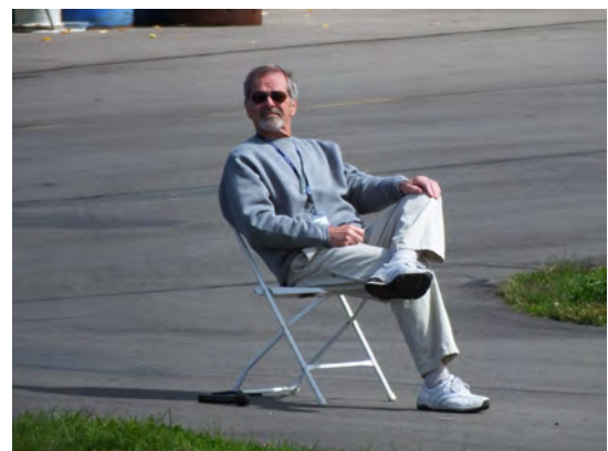
The Event Chair Overseeing the Well-Oiled Machine

After over 40 years of hosting a drivers education event at Grattan Raceway, it looks like your club does a very good job. We've got room on the track to see more WMR club members join in the fun next year.