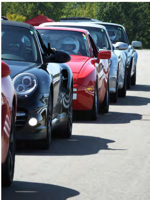
Get Ready, Get Set...GO!!!