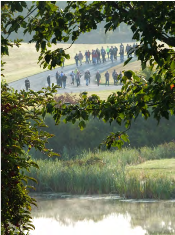
The Track Walk at the Beautiful Grattan Raceway