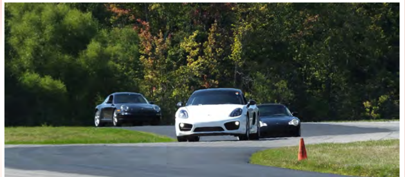
Porsches at Play