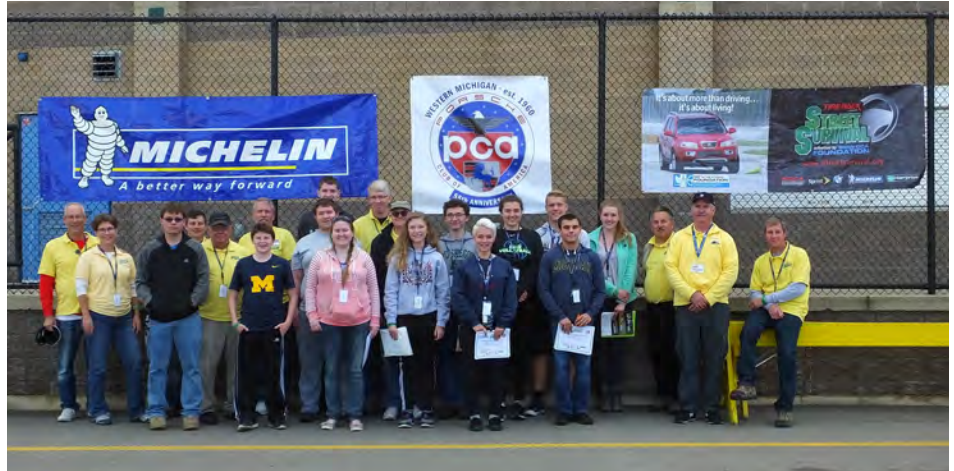
Tire Rack Street Survival Class of 2016 and Instructors