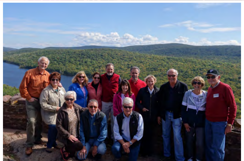
The Upper Peninsula Drive Crew Enjoying the Wonderful Weather and Scenery