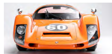
The Porsche 906