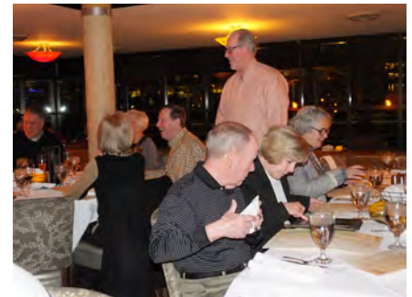
Good Food, Camaraderie and Conversation