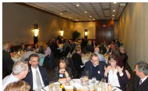
Excellent gathering of Porsche Enthusiasts!

Following the program, a live auction took place, benefiting Feeding America West Michigan Food Bank. Nearly $3,100.00 was raised for charity from a combination of the live auction and generous donations. The evening finished with more smiles, laughter and fellowship.