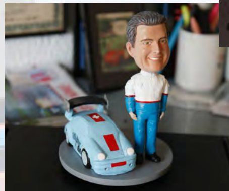
It's not all of us that have a bobble head doll of ourselves, especially with us standing alongside our race car.