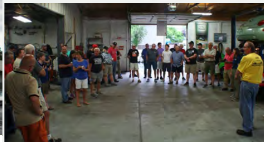
Forty members intently listening to the benefits of tire alignment and corner balancing