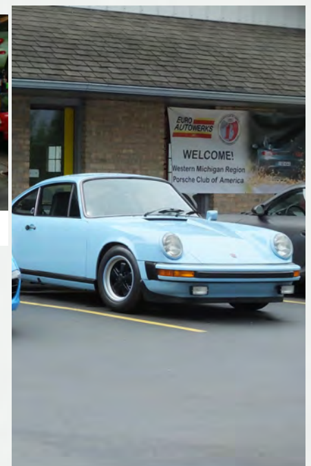
Welcome WMR PCA!