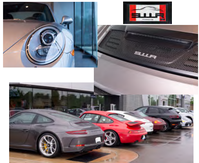
Rain or Shine, Porsche Never Looked Better!