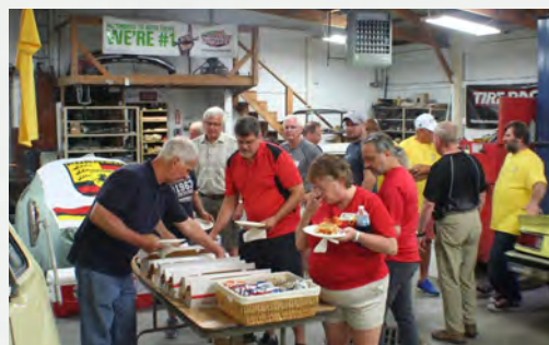
Serving up a delicious lunch