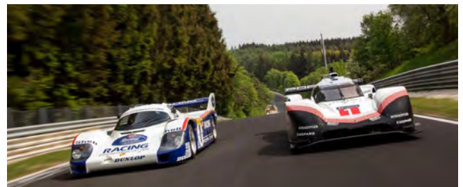
The Tribute Lap: Bellof's 956C (left) and 919 Hybrid Evo

The most successful marque in racing history, Porsche again demonstrated its prowess in April 2018 during this year's farewell tour of the LeMans-winning 919 hybrid 'Evo' prototype racer. Removing limiters imposed by WEC regulations on both the engine and electric motors and adding some active aerodynamic features, the 919 beat Lewis Hamilton's record pole time for the 2017 Belgian Grand Prix at Spa-Francorchamps in his F1 Mercedes by nearly a second. Interest was high when the 919 showed up ahead of May's Nürburgring 24-hour event, as many hoped to see if it could beat Stefan Bellof's all-time record lap of 6 minutes, 11.13 second set in 1983 in the Porsche 956C. Perhaps in honor of Bellof, who died in the 1985 Spa 1000 km race, the 919 and Bellof's 956C led the field in a ceremonial formation lap before the race. Well done!