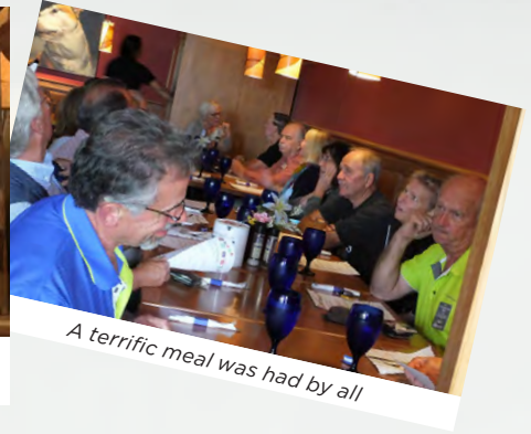
A terrific meal was had by all