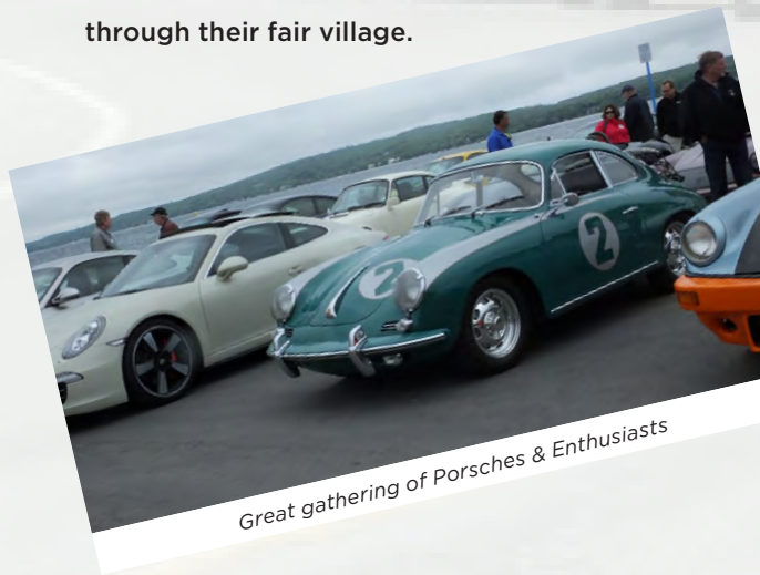
Great gathering of Porsches & Enthusiasts