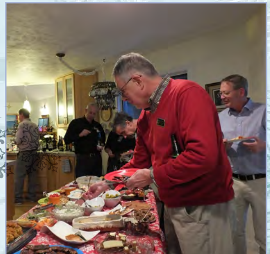
A festive feast!