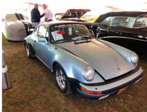
1986 930 Turbo