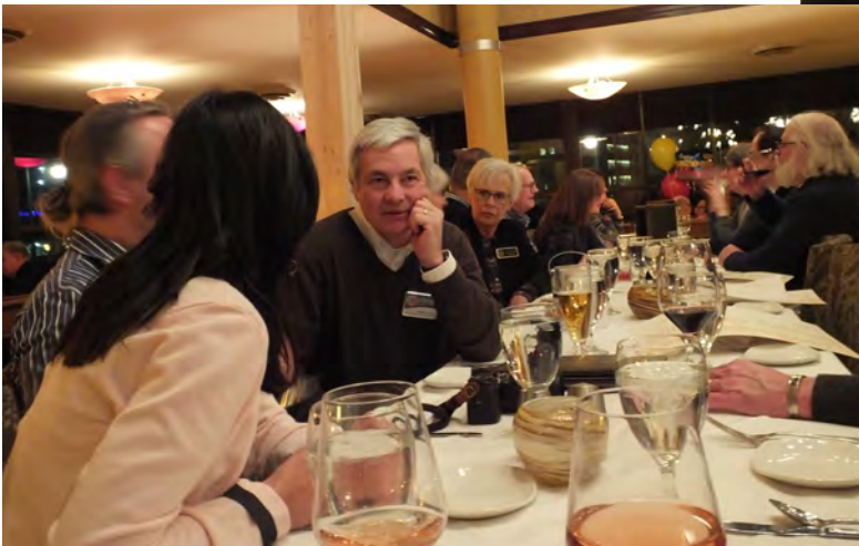
Lively conversations over drinks and dinner