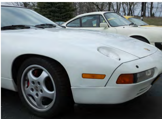
It's about time! Porsches are out to play!