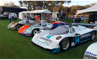
Al Holbert's 962 ride, #14 Lowenbrau