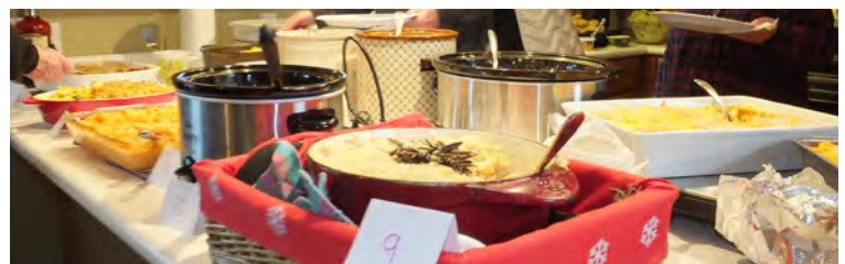
Not your Grandma's Mac & Cheese