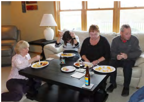
Some serious Fork and Spoon channeling to determine People's Choice

The weather stayed warm long enough for many people to drive their Porsches, some for the first outing of the year. And as always, when two or more members of the club are together, great fun ensued.