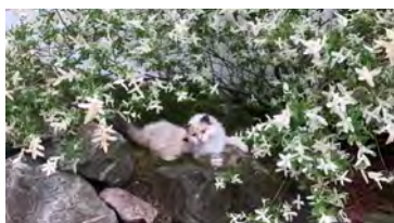
My kitten Danica always likes to be included, even when watching racing on TV or help in the yard.

One activity that is still able to happen are the Driving Education events for solo and advanced drivers. And where restrictions allow, some in-car instruction scheduled for October. These events still require volunteers, so please try to pitch in when and where it is safe.