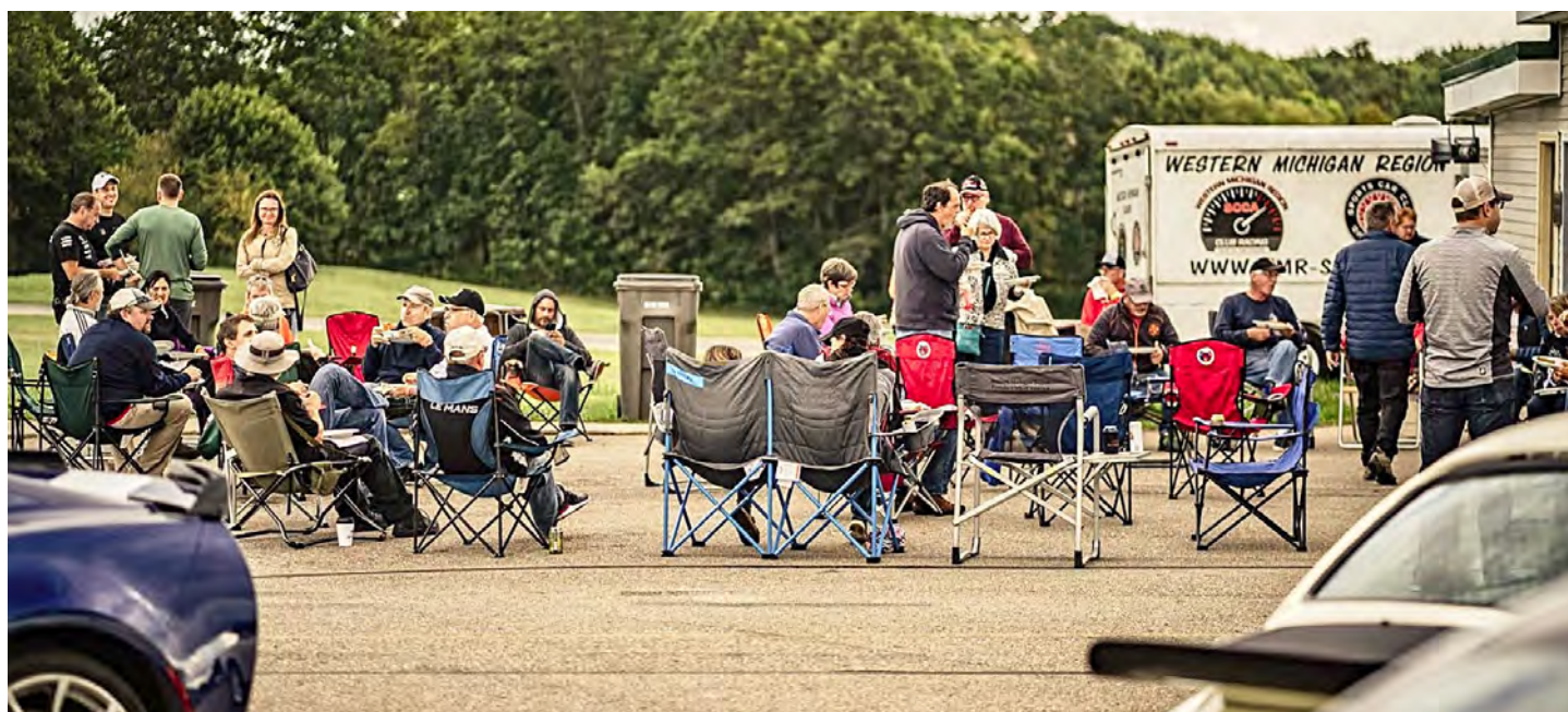
Relaxing after a GREAT day on the track with pizza and adult beverages