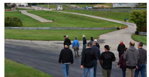
Grattan Track Walk 2019

For more PCA National and Inter-Regional events, visit: https://www.pca.org/events