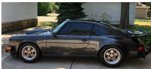
Lori's 911 - ready for the next tour or Show and Shine!

route? Keep good notes of roads, interesting landmarks and good stopping points. And then a good wash and detail when done. We all pamper our Porsches, right?