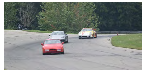
Porsches at Play Grattan 2019