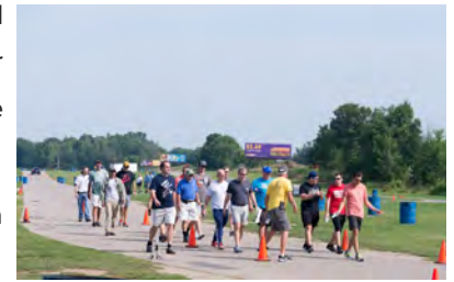
Track Walk 2017 IROC