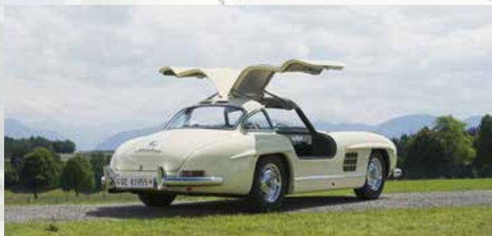
Mercedes Benz 300SL Gullwing

In 1958, I was a junior in high school in Kalamazoo, MI. After the school day ended, I waited several blocks away for the city bus to transport me home. Occasionally on a nice day, an ivory Mercedes Benz 300SL Gullwing roared by, a car I could not take my eyes off of. It turned out to be driven by a fellow who lived in my neighborhood. Since all I talked about was cars, then as I do today, I mentioned more than once to a mutual friend about the Gullwing. As a result, surprisingly, the car appeared in my driveway one evening with an introduction to it and an offer to drive it. What a once in a lifetime experience that drive was. I drove it east on I94 when traffic was more civil and road quality was better. I redlined the tach in each gear and reached well in excess of 100mph in what seemed an instant. I never experienced any collection of sensations like that drive in my life before or since. Memories of the sounds, smells and overall sensation are clear to this day. Nothing like it. It turns out the owner of the car was the uncle of the local driver. He lived in South Bend, Indiana and his