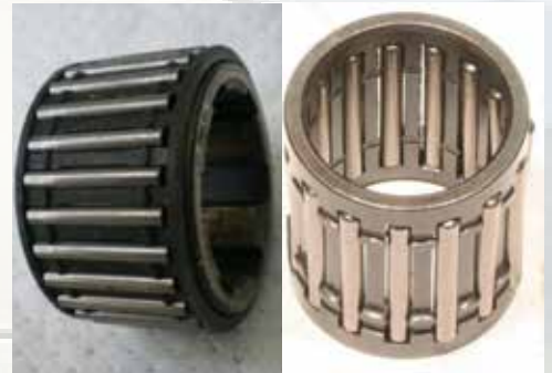
Bearings of the Hirth crankshaft