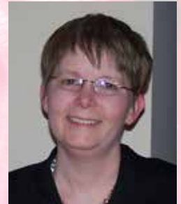
Amber Door Treasurer, 1984 Porsche 911 Coupe

Shelbyville, MI (616) 780-1210 marshallwalters911@gmail.com