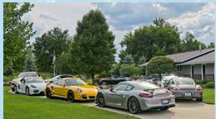
Premium parking for Porsches only

Watch WMR email blasts in the event the picnic is rescheduled or canceled.