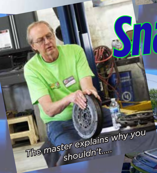
The master explains why you shouldn't.....