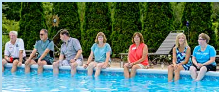
Pool Party 2016

WHERE: 10085 Edgerton NE, Rockford, 49341