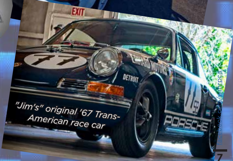
"Jim's" original '67 Trans-American race car