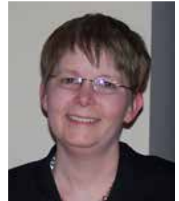
Amber Door Treasurer, 1984 Porsche 911 Coupe

Shelbyville, MI (616) 780-1210 marshallwalters911@gmail.com