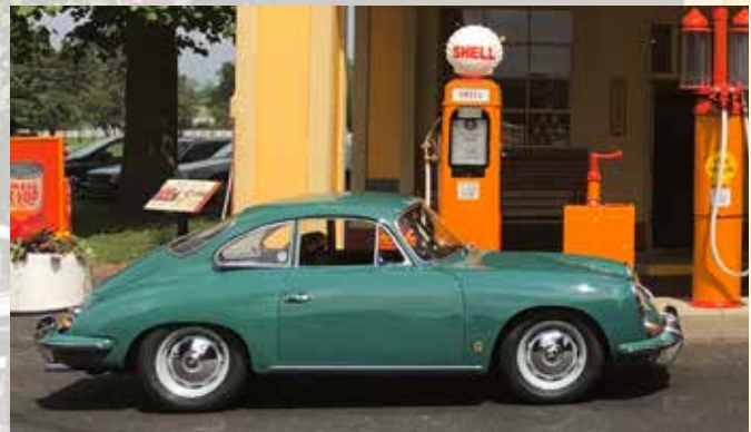
Fritz in his current outfit at the Gilmore Car Museum