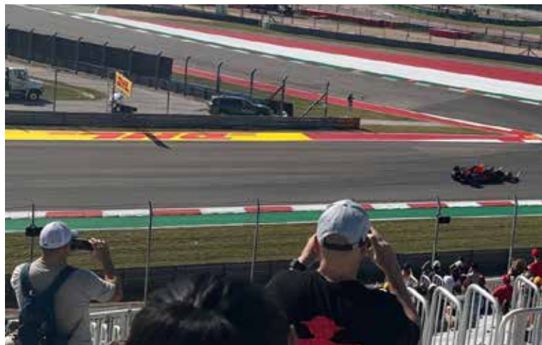
COTA Formula 1!

A few weeks prior, Daniel Ricciardo who drives for McLaren, won a bet with his boss Zac Brown, McLaren CEO. The bet was that if Daniel got to a podium finish before COTA, he would get to drive a few laps with the Monte Carlo owned by Zac that Dale Earnhardt drove to the 1984 NASCAR championship. Dani-Ric as we call him, spun donuts in 4 corners in his final lap - hilarious.