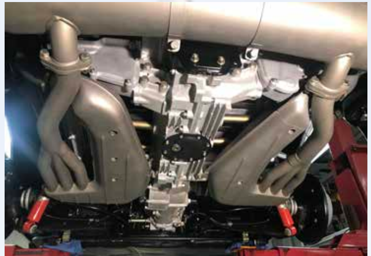
Amazing tech for '67 and pretty clean down there...

When the scores finally were posted the little silver 911S was in first place with a score of 298.7 out of 300!!! Amazing!