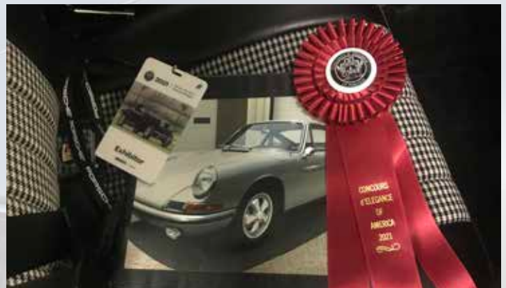
From blue to red...

Then the shenanigans started. You can no longer protest someone else's car but you can protest your own score if you think the judges were in error. 2nd place had a score of 298.5 and protested one of the judges scores. The place ribbons had been awarded by this time and the little Silver 67 911S that could had a first place blue ribbon on the windshield! Unbeknownst to me while I was in the protest committee room watching what was happening, my first place ribbon was removed and a 2nd place red ribbon was unceremoniously left on my chair