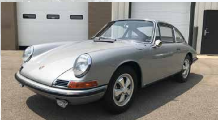
The little silver '67 911S

The car was ready for the Porsche Parade Concours d'Elegance when it went in my trailer in Grand Rapids.