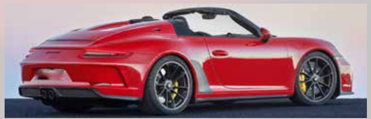
The best manual transmission driving experience?

Last but not least I have had the opportunity to drive the new 2019 911 Speedster 6 speed stick. That is the only way the car is offered, no PDK. I have to say it is the best, smoothest, most rewarding stick shift I have ever driven. Smoother and better than the 2018 GT3 6 speed stick and that is saying something.