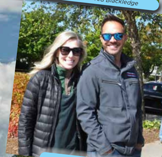
Just lot's of happy people