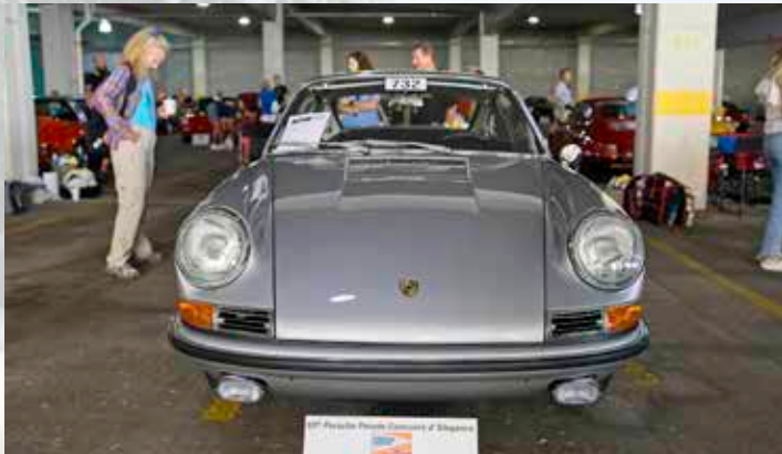
While waiting for the result, admirers stopped by frequently.

Our/my goal was to establish the condition and quality of work done on the 67S. A score of 289.7 and a Gmund award from PCA National for achieving that score certainly accomplished that.