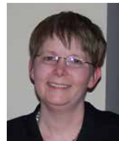
Amber Door Treasurer, 1984 Porsche 911 Coupe

Shelbyville, MI (616) 780-1210 marshallwalters911@gmail.com