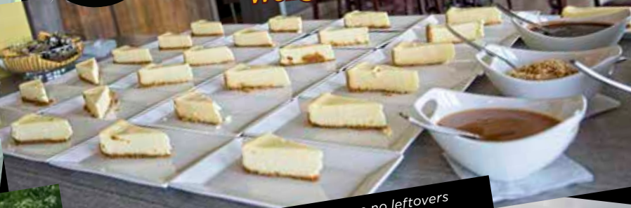
Cheesecake and toppings, there were no leftovers