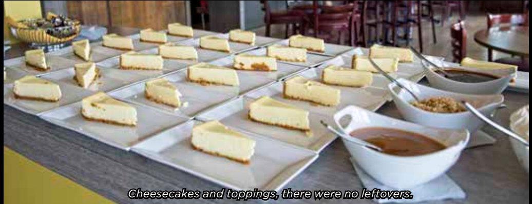
Cheesecakes and toppings, there were no leftovers.

The Lakes 23 Dinner Drive started out a little wet. But, we had good attendance with 20 cars. Within the first hour the rain had stopped and the roads were dry. The route wasn't familiar to anyone except myself and I wanted winding country roads with wooded and open farm sensory. The drive took a little over an hour leaving from the Meijer store on 10 Mile Road in Rockford and headed north-westerly through Sparta, Kent City, Grant, Bridgeton and finally arriving in Fremont at the Waters Edge Country Club. The drive didn't disappoint according to feedback from participants.