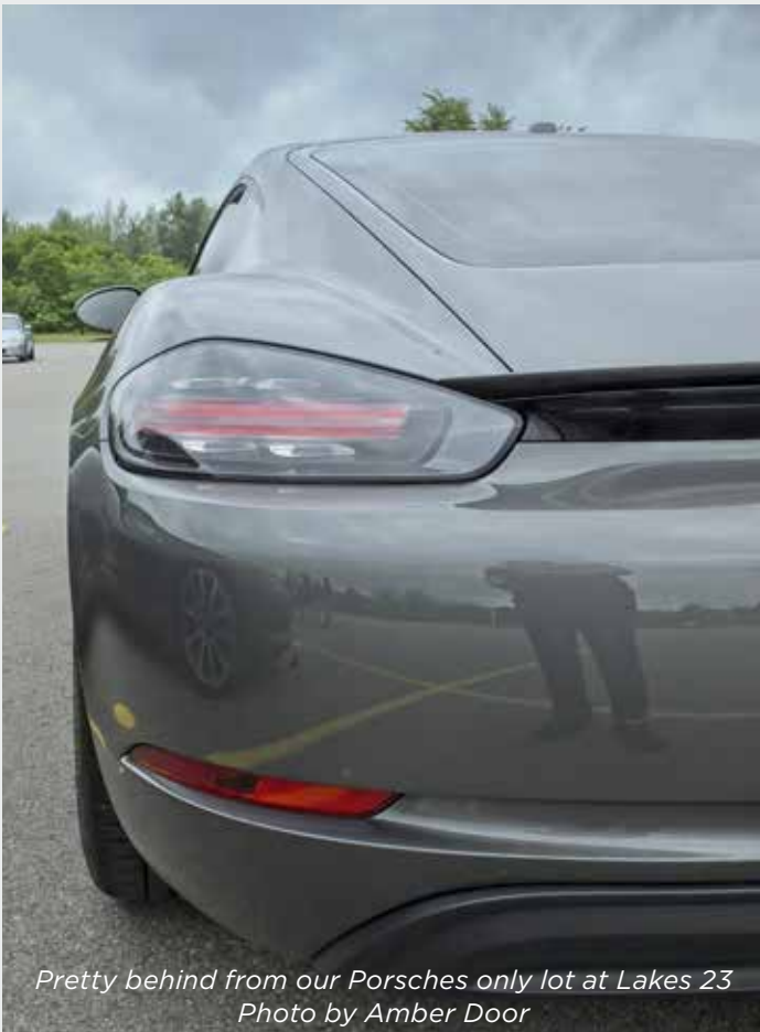
Pretty behind from our Porsches only lot at Lakes 23

Locally owned by PCA members Greg & Karlene Curries