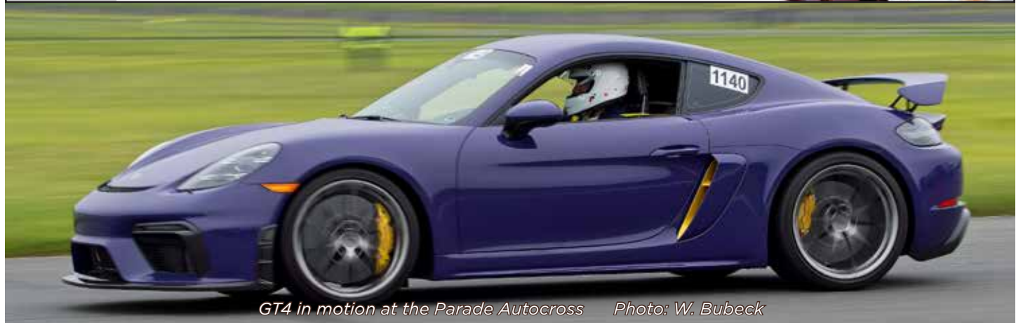
GT4 in motion at the Parade Autocross

ACCESS THE MONTHLY MEETING MINUTES ON OUR WEBSITE.