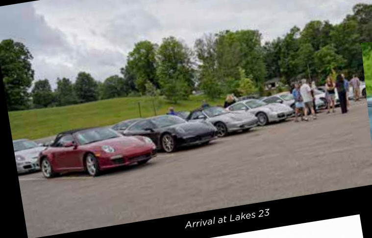
Arrival at Lakes 23