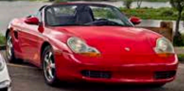
Lakes 23 Lunch Drive Fremont, MI