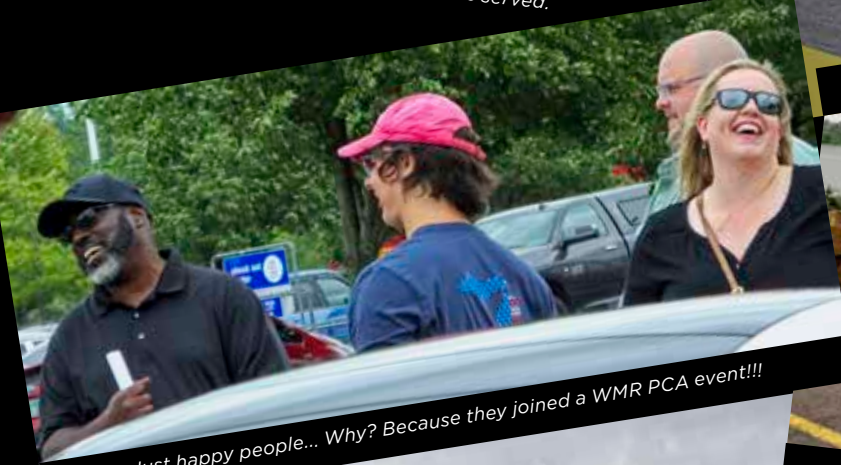
Just happy people... Why? Because they joined a WMR PCA event!!!