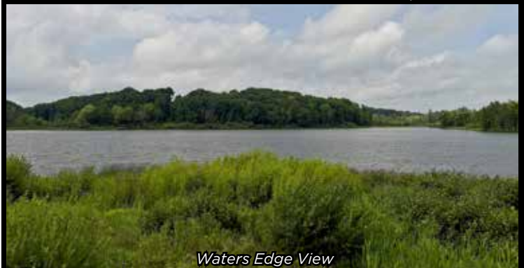
Waters Edge View