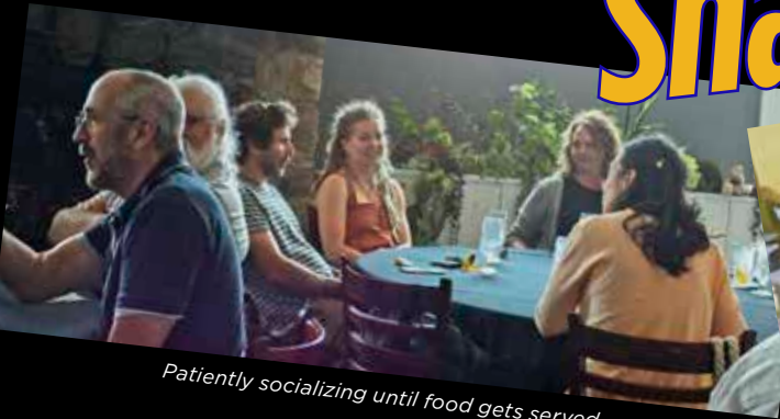
Patently socializing until food gets served.