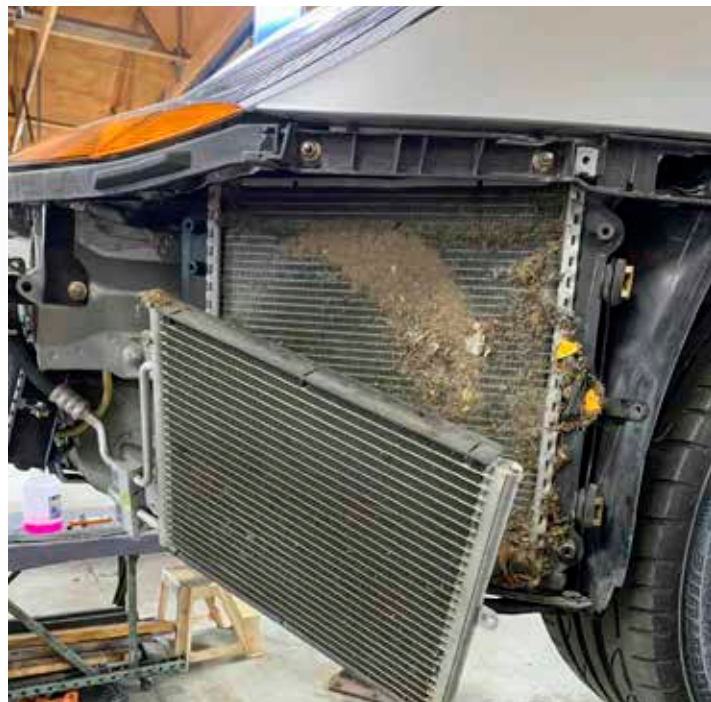
...but the space in between the condenser & radiator is packed with debris from the outside

a clogged condenser and/or radiator. Even if it looks clean, very often we find that there are fine fuzzy like materials stuck between the condenser and radiator. This material prevents normal air flow through both units causing higher than normal engine temps and poor A/C output.