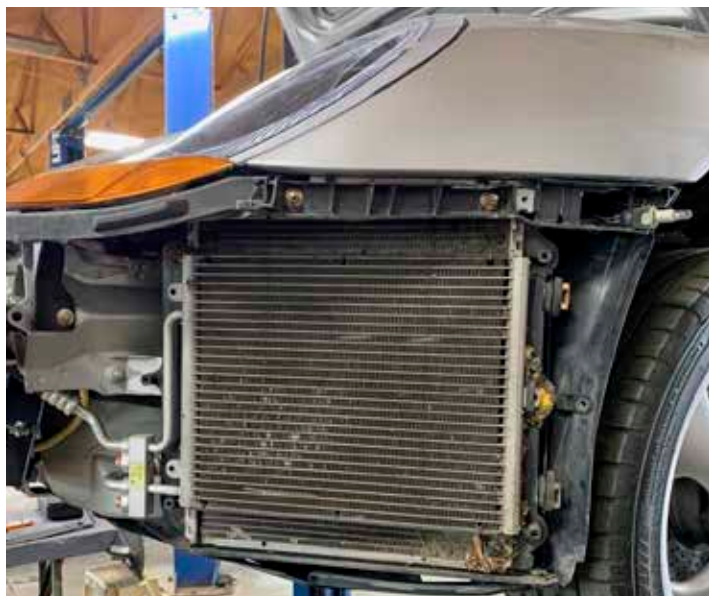
The radiator looks fine from the outside...

Keep in mind that the internal combustion engine is a heat pump, with approximately 1/3 of the energy generated used to produce your car's forward motion, 1/3 of the energy produced is removed as heat by the exhaust system, the remaining 1/3 has to be removed by the cooling system.