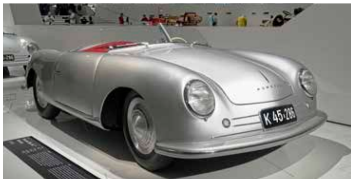
Porsche No.1 - The first prototype from 1948

We stayed until the 6pm closing time. I had finally fulfilled my goal of visiting Porsche in Germany and witnessed both the production and the preservation of historic Porsche sports cars over the years.