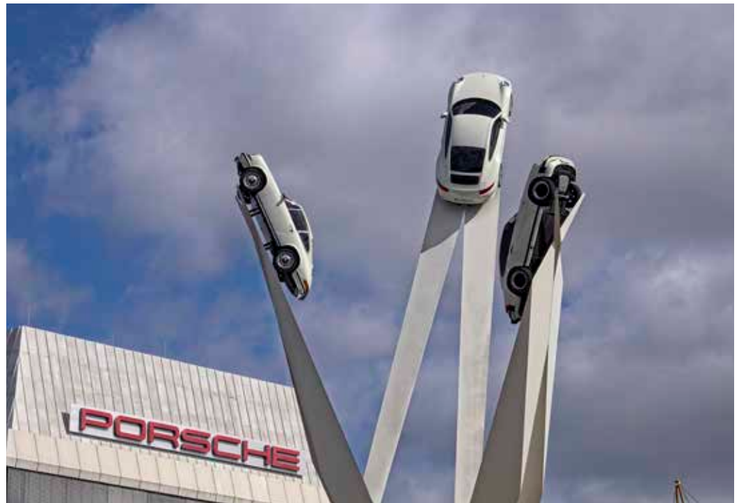
Porsche 911 statue designed by Gerry Judah sits in between the Museum and the factory in Zuffenhausen