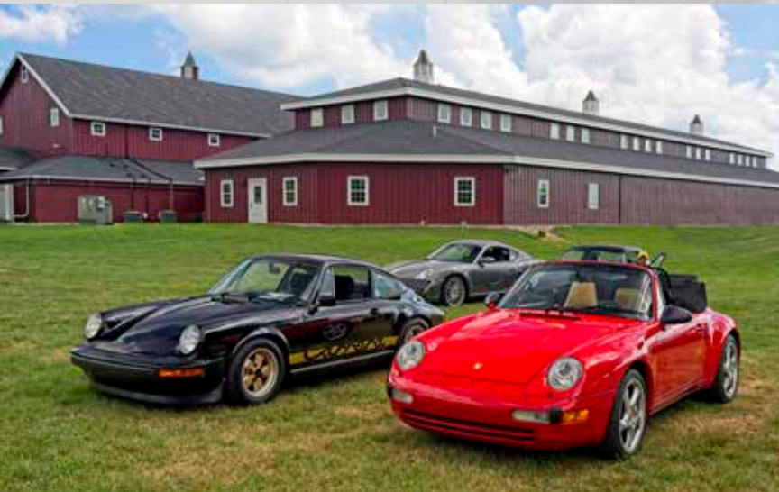
The last ones to leave....