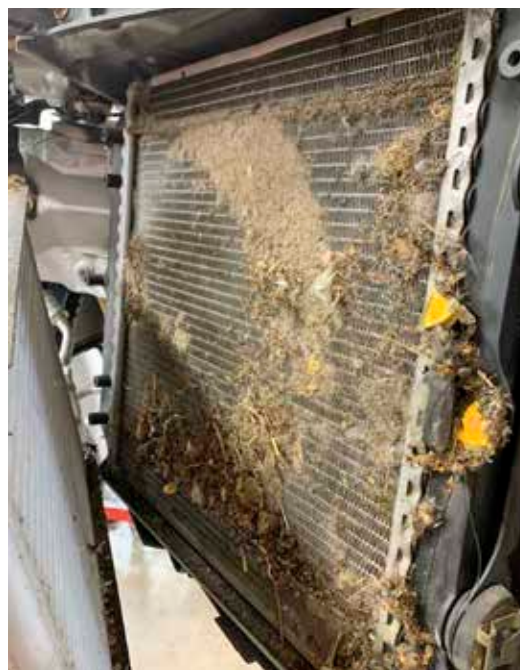
Close up of plugged radiator

Cleaning the areas between the radiator and condenser is done by removing the front bumper and separating the two units from each other. This allows you to thoroughly clean every area around the two pieces. Pay particular attention to debris collecting in the lower corners of either the radiator or condenser. Allowing debris to gather and set in these corner areas will cause leaks over time. It's important that debris be removed and the radiator and condenser be cleaned every 60,000 miles.