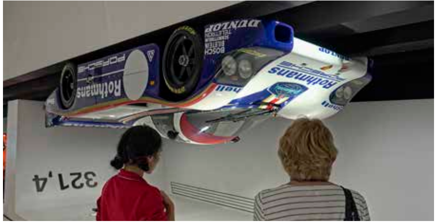
Le Mans 956

from the ceiling upside down. This race car is mounted this way to demonstrate the strength that downforce can exhibit to a racing car at speed. In the case of the 956 the downforce was purportedly enough for the car to race up-