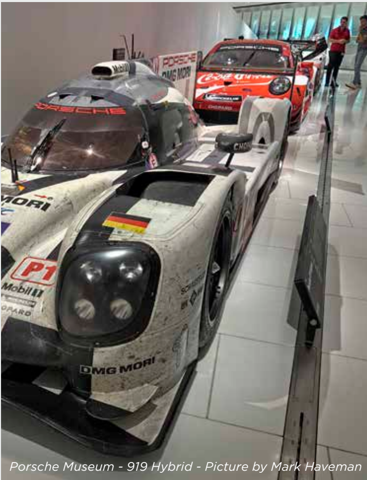
Porsche Museum - 919 Hybrid