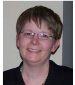
Amber Door Treasurer, 1984 Porsche 911 Coupe

Shelbyville, MI (616) 780-1210 marshallwalters911@gmail.com