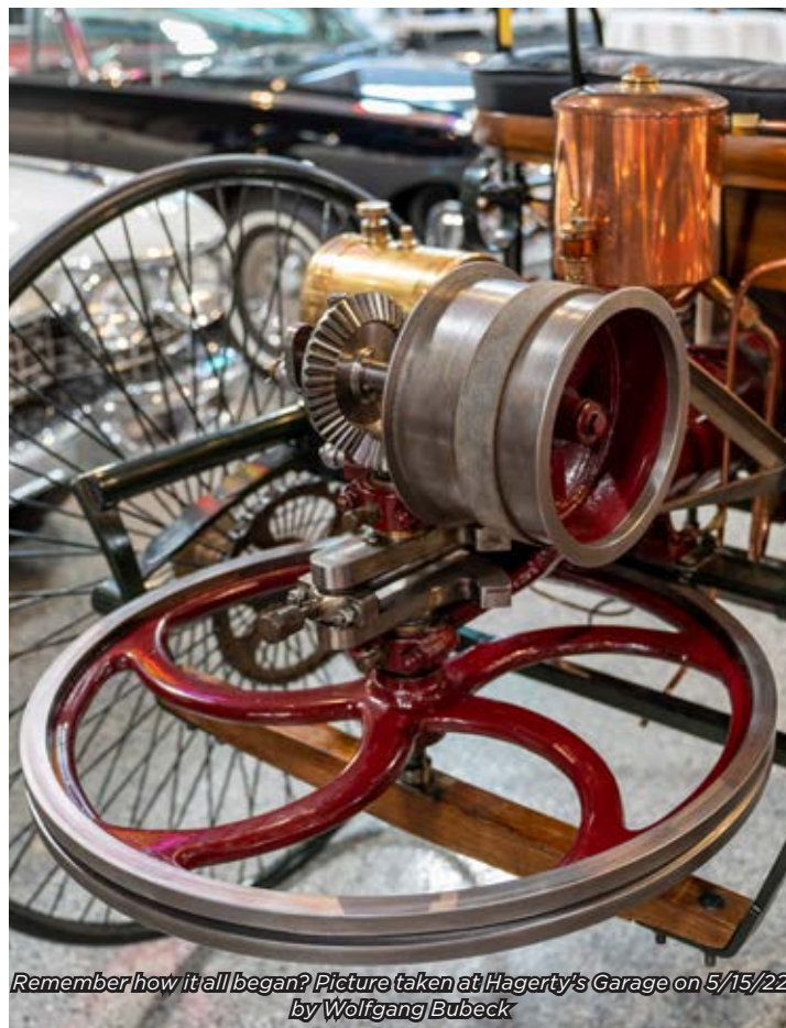
Remember how it all began? Picture taken at Hagerty's Garage on 5/15/22