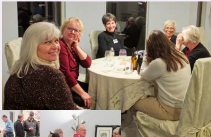
The ladies only table