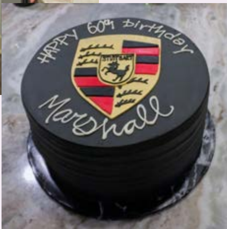
...and her unique birthday cake

what to do or host your first event. Fear not. You will have guidance, support, and resources from the club or previous event hosts. Our club is fueled by volunteers and like we always say in the club, "it's not just the cars, it's the people."