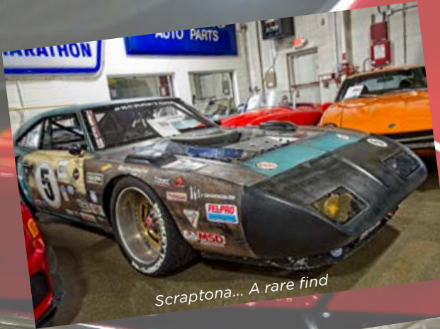
Scraptona... A rare find