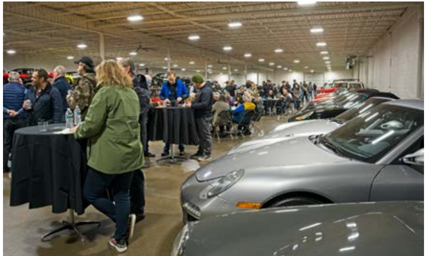
Perfect setup from GKM to gather people around nice cars