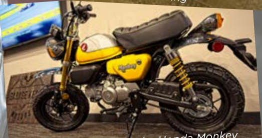
The new version of the Honda Monkey