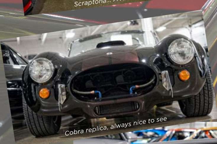
Cobra replica, always nice to see