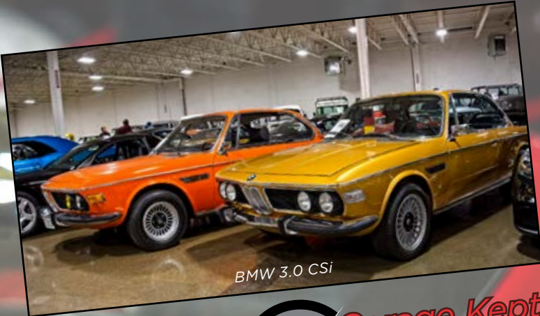
BMW 3.0 CSI