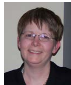
Amber Door Treasurer, 1984 Porsche 911 Coupe

Shelbyville, MI (616) 780-1210 marshallwalters911@gmail.com