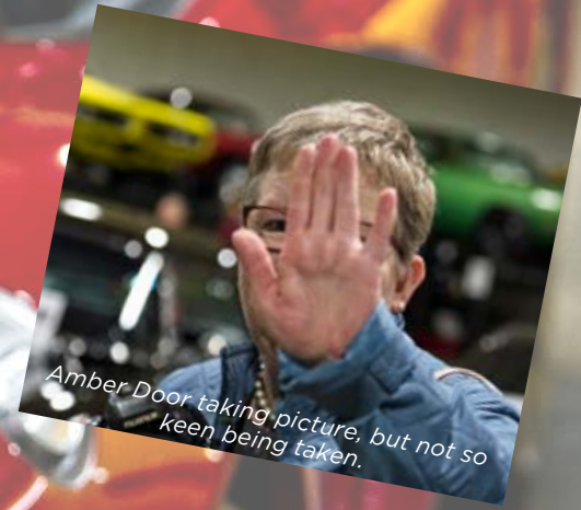
Amber Door taking picture, but not so keen being taken.