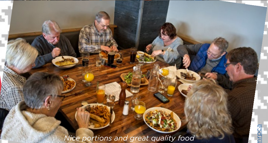
Nice portions and great quality food