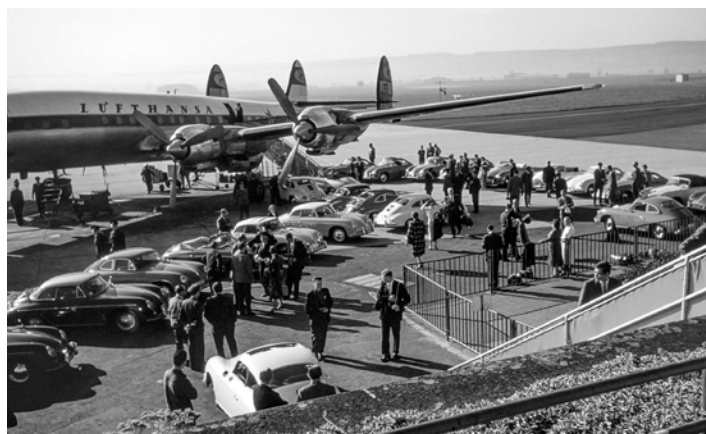
The PCA group is welcomed to Stuttgart with much fanfare