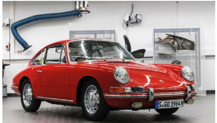
The Porsche 911 could have been the Porsche 901 and the world would have been super weird.

In 1989 Ferry retired from the company. This is just a short