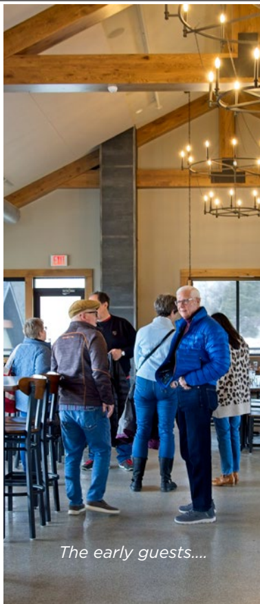
The early guests...

It can be difficult for the restaurant employees to prepare food and keep everyone satisfied when 54 people arrive at once. They did an excellent job and upheld a high standard for a brewery environment. We had complete freedom to choose from all of their choices rather than being restricted to a small menu. From the organizational aspect to the providing, Archival delivered an excellent service. Everybody seemed to be happy.