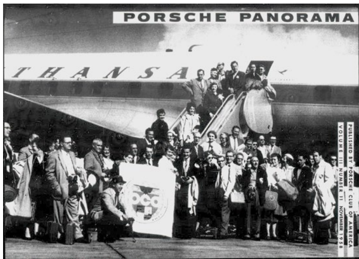
Cover of Porsche Panorama issue, Nov 1958 showing the PCA members arriving in Stuttgart