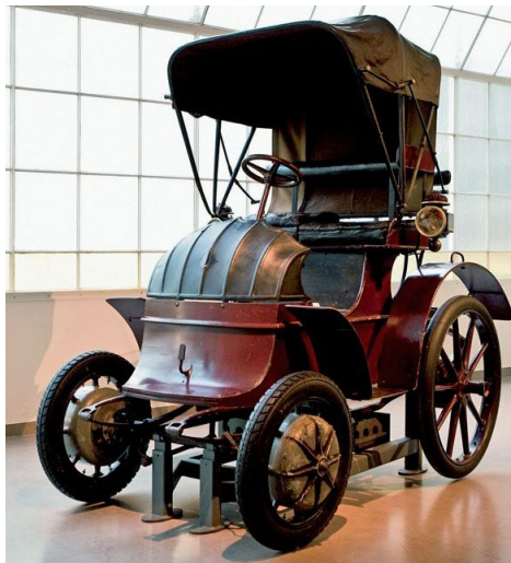
The first petroleum-electric hybrid vehicle launched 110+ years before the Tesla S.

It was powered by an octagonal electric motor. He went on to develop the electric wheel hub motor. In 1900 he designed the first functional hybrid car, called the Semper Vivus, using a combustion engine to drive a generator which supplied power for the electric wheel hub.