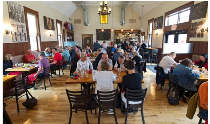
Texas Corners Brewing interior exclusively occupied by Porsche people