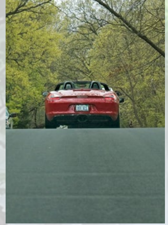
On the road again...