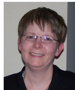
Amber Door Treasurer, 1984 Porsche 911 Coupe

Shelbyville, MI (616) 780-1210 marshallwalters911@gmail.com