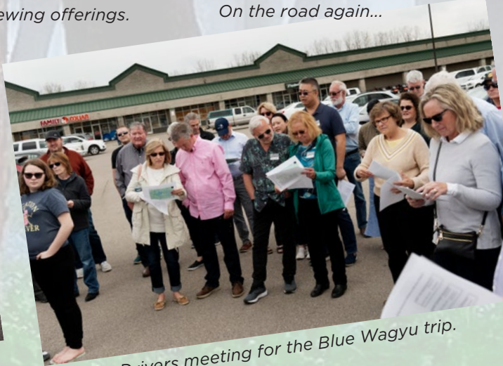
Drivers meeting for the Blue Wagyu trip.