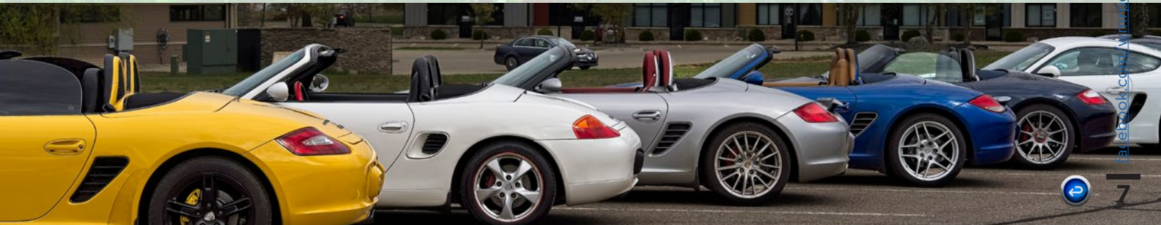
May the Porsche be with you—in this case, five consecutive Gen 1 and Gen 2 Boxsters.