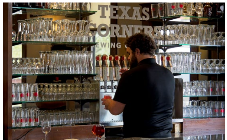
The bartender is going about his business. We kept him busy.