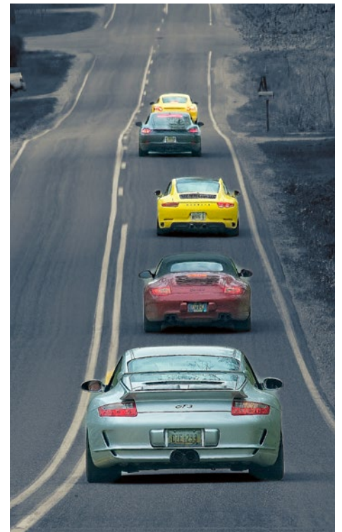
The open road...

For those of you who missed this event, I encourage you to take a leisurely drive to Yankee Springs Golf Course to experience The Blue Wagyu for yourself. For those who joined us, a big thank-you!