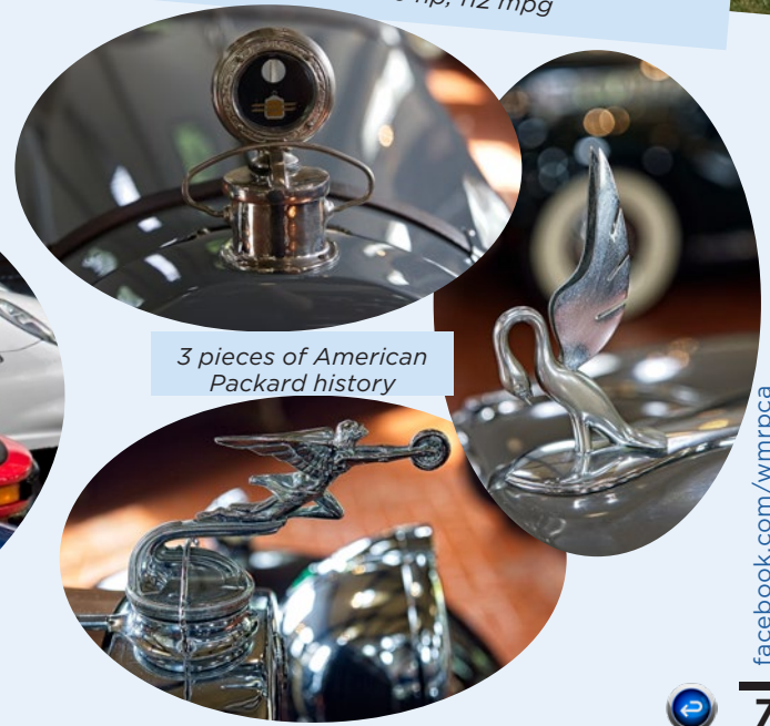
3 pieces of American Packard history