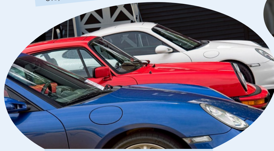
The American colors in a Porsche layout