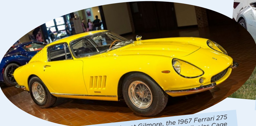
Not German, but on display at Gilmore, the 1967 Ferrari 275 GTB/4 with a V-12 engine was once owned by Nicolas Cage