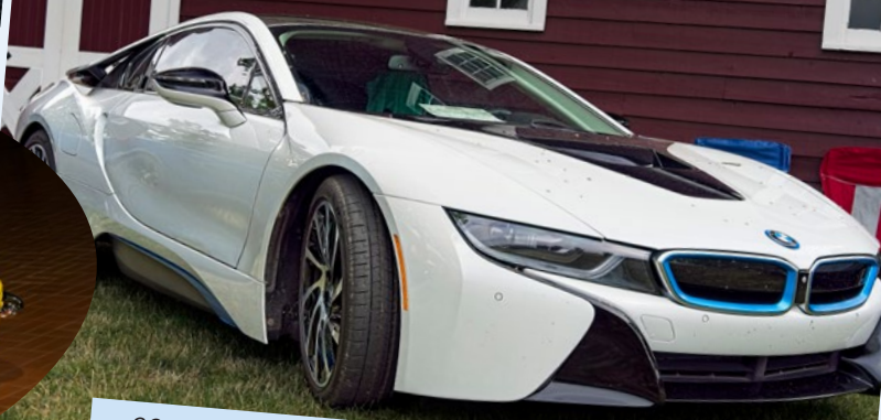
20465 units were built of BMWs i8 from 2014 to 2020 Plug-in hybrid, 369 hp, 112 mpg