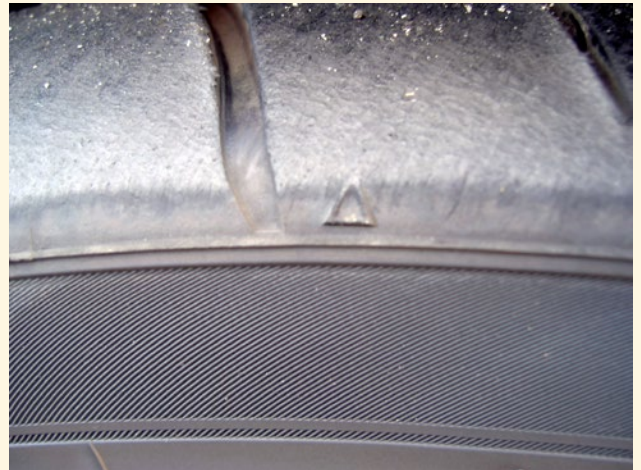
Dropping a couple of pounds of pressure and then hitting the track again gives us the optimal patch, as seen below where the edge of the wear is right to the tip of the marker.