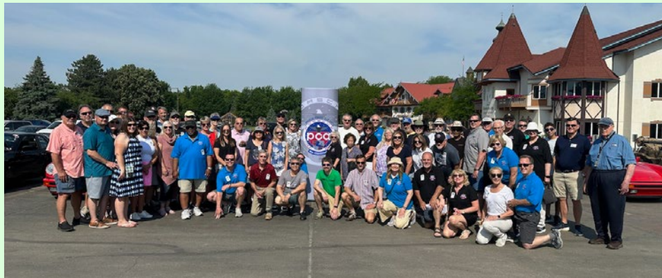
Motorstadt Region Gathering, Frankenmuth, MI