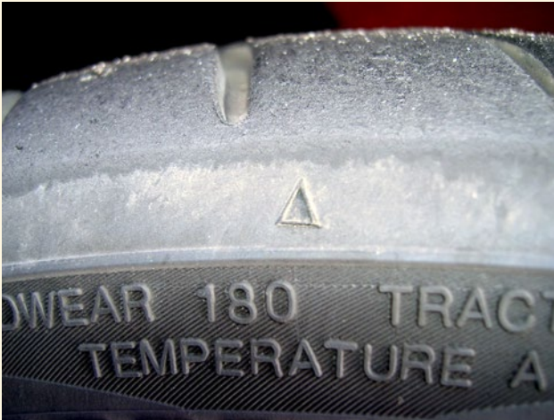
As you can see above, the wear is a little short of the marker, meaning that we have too much pressure.

This triangle tells us where the edge of the optimal tread wear should be.