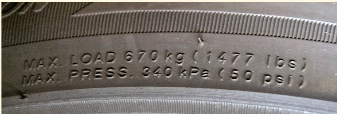
Also, always keep in mind that you should never inflate beyond the tire's maximum pressure, stamped on its sidewall.

For more information about tires and other topics of interest for your Porsche, please visit our website at: