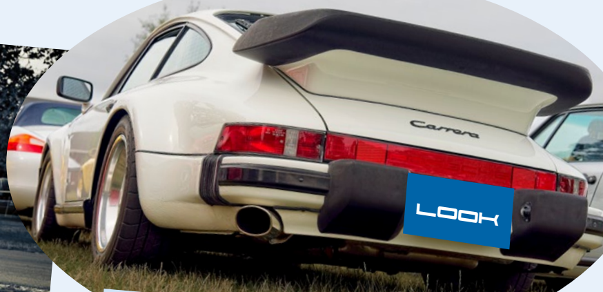
A 911 Whale Tail on a wide behind is always worth a look.