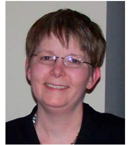
Amber Door Treasurer, 1984 Porsche 911 Coupe

Shelbyville, MI (616) 780-1210 marshallwalters911@gmail.com