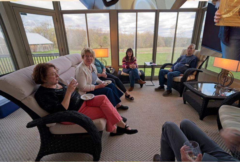
Preparing for the soup marathon in the sun room.