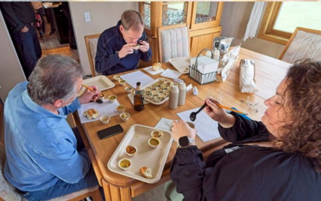
Soup judges on duty.